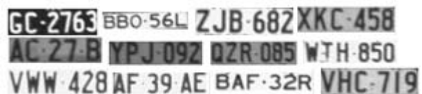
Fig. 7. Some sample license plate images

We apply the above algorithm to the car license plates on a video footage taken by a CCD camera. Fig. 7 shows some license plate images for our experiments. Altogether, there are 587 license plate images with 3502 characters. All characters are correctly segmented. Fig. 8 shows some of the characters segmented after binarization. The false positives (i.e., non-character areas that are segmented) are mainly due to the false detection of license plates in the step shown in Section 2. There are only 7 out of total 594 license plate detected regions which are non-license plates. This rate is (594-587)/594=1.18\% . Therefore, our correct segmentation rate is still very high and about 98.82% even taking into account the rate of wrongly detected license plate regions.