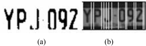
Fig. 5. Character 'J' is separated into two segments by mistake

For example, as shown in Fig. 5(a), character 'J' was separated into two in the binary image because the real lower bound has been lifted for too much (see Subsection 3.1). Therefore, in the segmentation result, the 'J' region has been separated into two character segments with width 2/3 smaller than the average width (see Fig. 5(b)). We hence need to combine these two segments into one single segment.