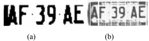
Fig. 6. Segmentation of character 'A' from the connected left boundary of the license plate

As another example, Fig. 6(a) shows character 'A' connected to the left boundary of the license plate. Therefore, the left boundary and the region containing 'A' are grouped into one single segment with width 1/3 bigger than the average width after the previous step as described in Subsection 3.2.2. We hence need to separate the single segment into two segments. The final segmentation results are displayed in Fig. 6(b).