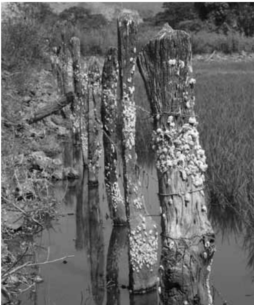
Posts covered with apple snail eggs indicate extremely high snail densities—a huge problem for Ecuador's rice farmers.

For more information contact IRRI, DAPO Box 7777, Metro Manila 1301, Philippines. Tel: +63 2 580 5600 or +63 2 845 0563; Fax: +63 2 580 5699 or +63 2 845 0606; email: info@irri.org ; web: www.irri.org