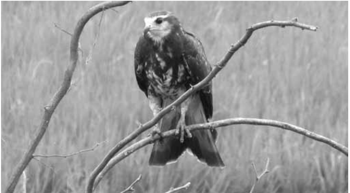
The snail kite ( Rostrhamus sociabilis ), a predatory bird that specialises in eating snails.