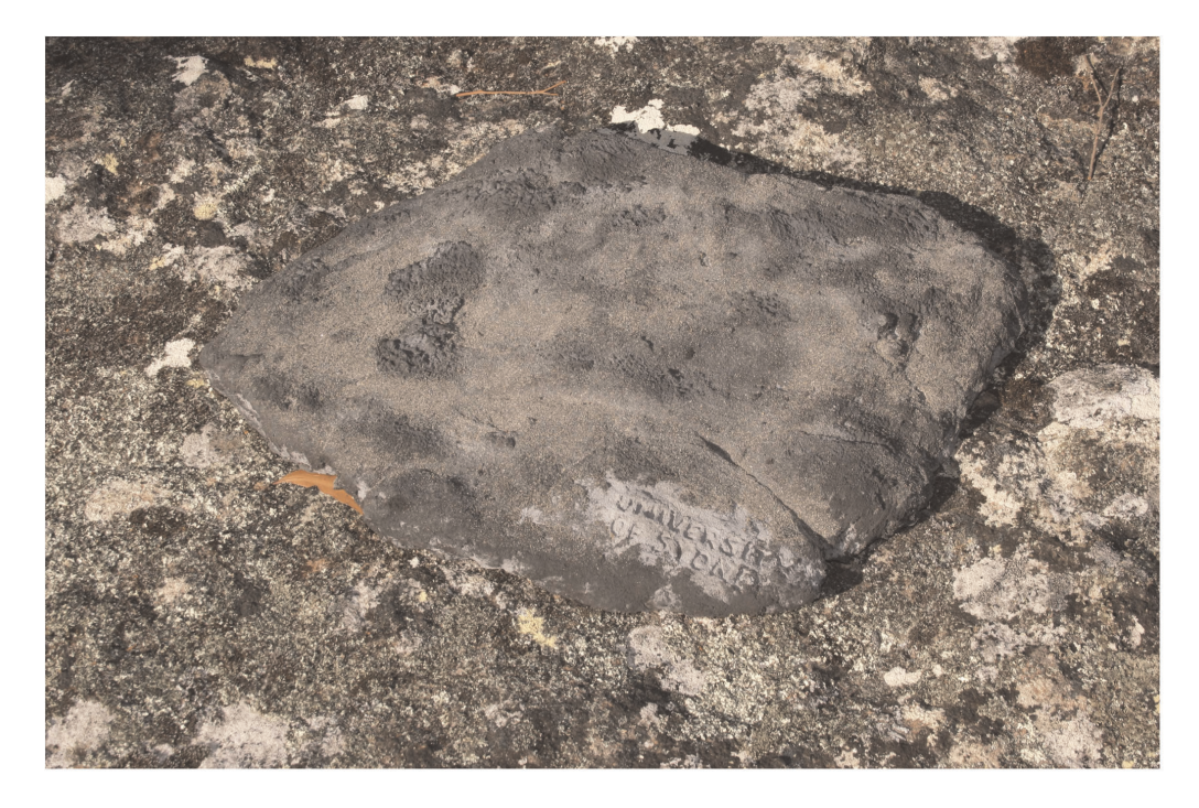
Figure 1. An artificial rock on site. Artificial rocks were designed to provide crevices with attributes preferred by saxicolous reptiles. All rocks were placed on flat ground to provide crevices 4 to 11 mm high, in areas with open canopies overhead and on the western side of the outcrops to allow relatively high sun exposure (and thus, favorable thermal regimes). doi:10.1371/journal.pone.0037982.q001