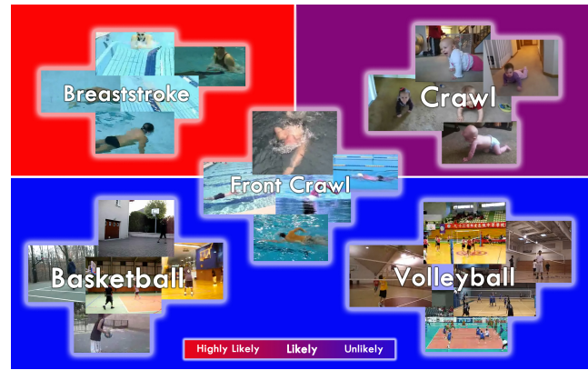
Figure 1: An example of recognizing the unknown action front crawl . It is highly like breaststroke , like crawl , but unlike basketball and volleyball .

The task of zero-shot learning is to recognize classes that have never been seen before. Namely, there are no posi-