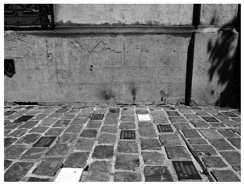
The front façade, Londres 38, showing the marks of burning candles resting against it during the vigils held for the detained-disappeared.

two testimonies, or paste photographs of the detained-disappeared on the walls. Father, mother, daughter, son, husband, wife, Donde está? Where is he? Where is she? Early next morning the O'Higgins workmen arrived to pull the posters off and whitewash the wall. The despairing cries to the disappeared had themselves disappeared. All that remained, to careful observers, were a few whitewashed corners of posters too hard to remove, and the tiny marks at ground level where the vigil candles had discoloured the once elegant white façade.