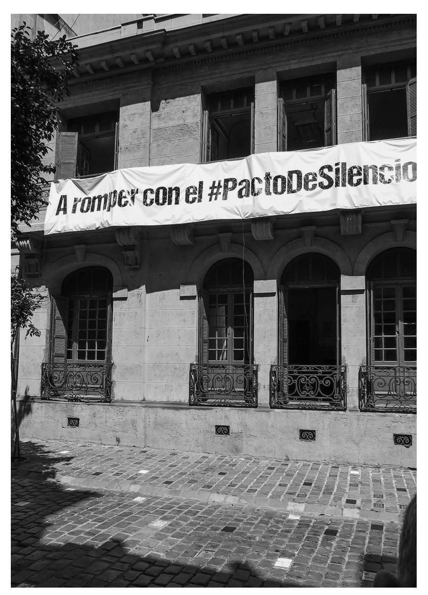
Londres 38 with its message of November 2015, 'Break the pact of silence'. On the darker flagstones are inscribed the names of the detained-disappeared believed held here, and their political affiliation.