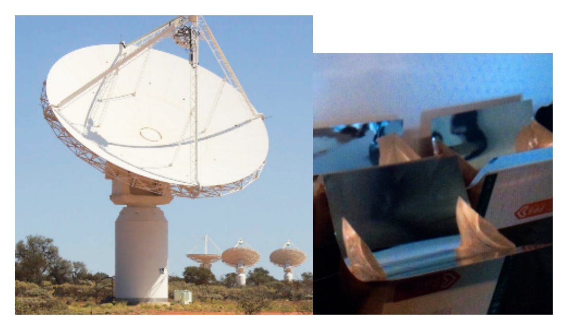
Figure 2. Radio telescopes inspire parabolic cookers (CSIRO, Maths Inside Project Team).

The use of active learning methods is the basis of all the classroom materials in "Maths Inside". For example, after viewing the video about the Square Kilometre Array and hearing from astronomers how parabolic dishes collect radio waves, students then build their own parabolic trough solar collectors to cook a sausage, boil water, and melt marshmallows (see Figure 2). The mathematical properties of the reflection of the sun's rays through the focus of their cardboard parabolas are not only visible but also effective, in real-world terms, to provide heat for cooking. Links to the use of inexpensive and readily available technology for cooking in the developing world are made. After the practical and global applications are appreciated, the students more readily engage with the mathematics. The geometric properties of the parabola are then analysed with co-ordinate geometry, making this an unforgettable lesson.