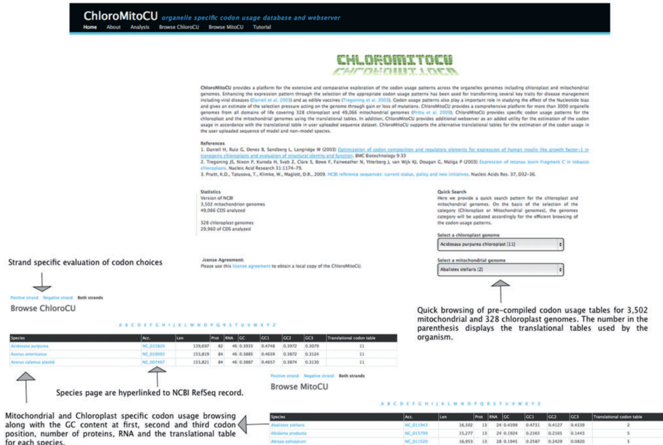
Figure 1. The efficient browsing system of ChloroMitoCU.

of tRNAs, and the usage patterns and relative frequencies of codons (Fig. 1). Figure 1 shows the user-friendly interface of ChloroMitoCU, which offers a two-way search for browsing chloroplast-specific codon usage patterns (Browse ChloroCU) and mitochondria-specific codon usage patterns (Browse MitoCU). In addition, a dropdown menu provides the alphabetically sorted list of the chloroplast and mitochondrial genomes with associated translational codes. Lastly, all of the alphabets in the quick-search forms are hyperlinked to the corresponding codon usage-pattern page of the selected species.