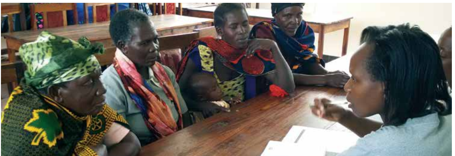
SNV in Tanzania: SNV advisor in discussion with female household heads in Chato district to establish how they have benefitted from the project