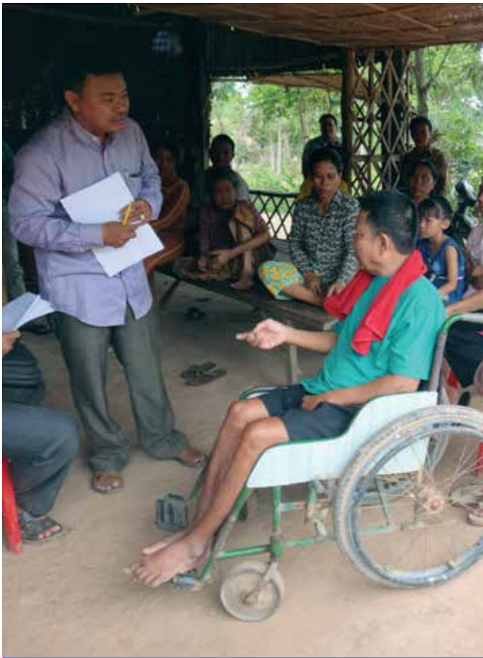
SNV in Cambodia: Sanitation planning activities with PLWDs