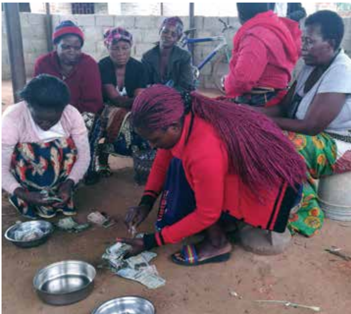
SNV in Zambia: Members of the Lua Luo sanitation marketing micro financing committee mobilising savings from members

This research found that the 'last mile' differs across programme locations, comprising a mixed group of people, and that affordability should not be assumed as the main barrier for access to sanitation.