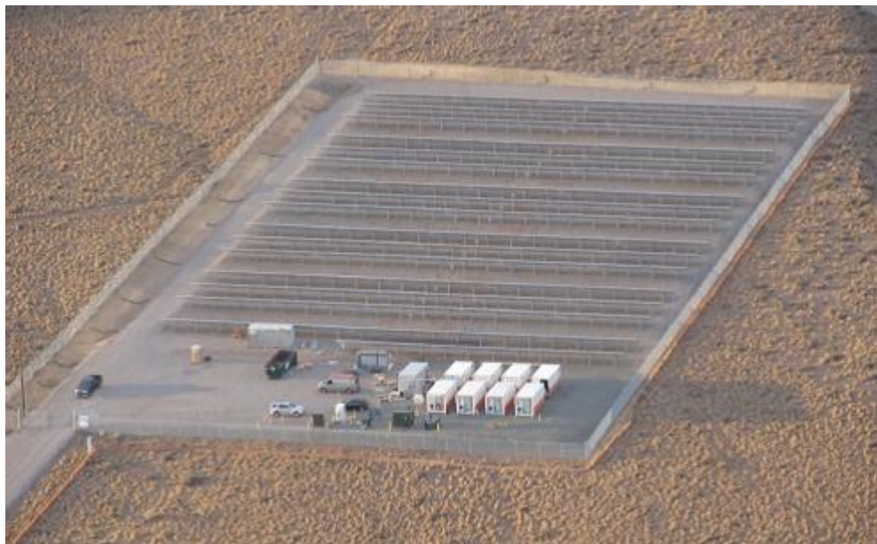
Figure 2 Aerial view of the Prosperity Electricity Storage Project in New Mexico, USA 62 (reprinted with permission)