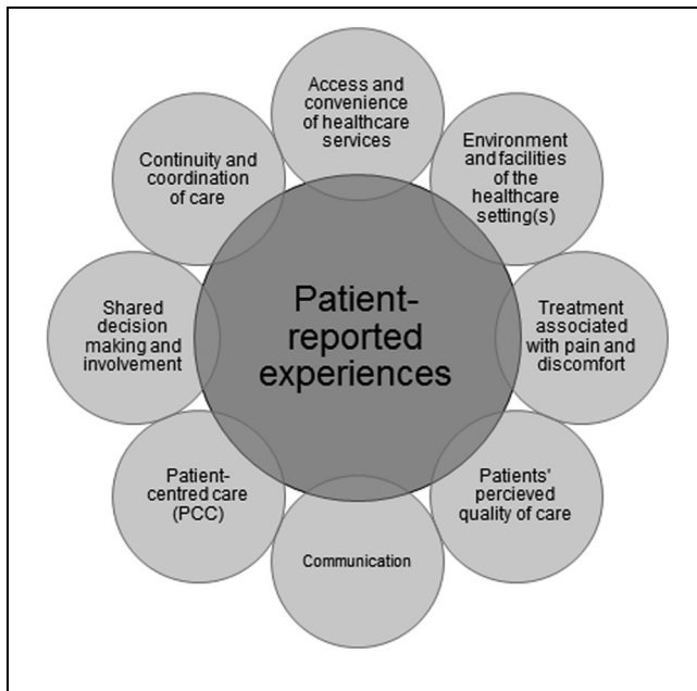
Figure 1 Themes representative of patient-reported experience as captured by PREMs.

patient-centered care; shared decision making and involvement in care; and the continuity and coordination of care (Figure 1). In general, these themes align strongly with the NHS of England, National Clinical Guidelines Centre (NICE), and Institute of Medicine (IOM) definitions of quality in health care, which promote care that is safe, patient-centric, effective, efficient, and equitable. 8–10