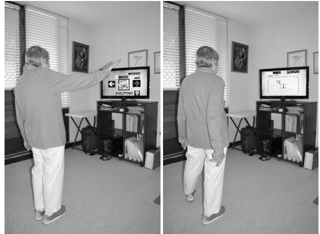
Figure 1: A participant interacting the main menu in StepKinnnection (left) and playing one of the stepping tasks (right).

In the work done by Draganski and May [2008] and Bhatt et al. [2012], stepping exercises involving a series of induced slips were shown to be an effective method for reducing falls in a laboratory setting. Similarly, in the work done by Studenski et al. [2010], step training showed improvements in dynamic balance and balance confidence, both associated with falling. Stepping requires the integration of several dimensions such as sensory, central and neuromuscular systems. By taking a short proactive or reactive step an individual can increase their base of support regaining balance. Hence, training this ability is important because it could be the last resort to prevent a fall from happening.