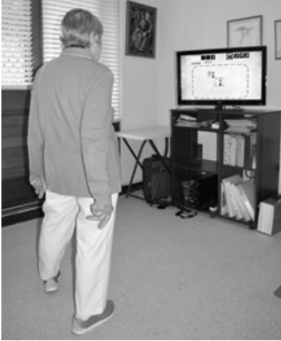
Fig. 1. The original StepKinnexion game being played by a participant of the at-home three month user study.

The study performed here is small and utilizes the authors as participants but the insights generated are useful for examining the potential of combining skeletal tracking and virtual reality before investing in detailed game design and exposing the elderly target audience to an unknown gameplay interface. While this paper is aimed at games for the elderly and specifically for step training, the knowledge presented here is more generally useful for game design and exertion games [11] researchers.