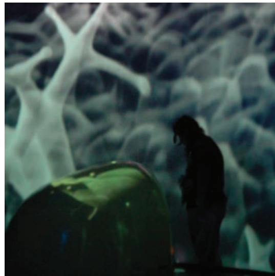
Fig. 3. The Moving Stone Garden , installation, Hamamatsu, Japan, 2004.

The narrative surrounding Ascension Island is intertwined with citations from well-known personages from the nineteenth-century period of European expansion and colonization; these include excerpts from the diaries of Captain James Cook, Charles Darwin, Joseph Banks and Joseph Hooker. Together, these men and others engaged in a hitherto untried and ambitious terraforming exercise that brought the selected botanical collection of the “empire” together on Ascension Island. One