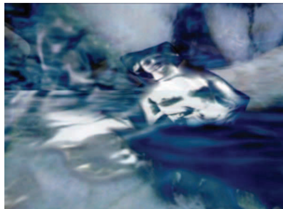
Fig. 2. Video still from Ariadne auf Naxos (Strauss), 2002.

The first project in which I sought to layer site and consciously realize an entire world in this way was the media scenography for Richard Strauss's opera Ariadne auf Naxos , performed at the Sydney Opera House in 2002 [4]. The opera's main protagonist is the Greek mythological figure Ariadne, the daughter of King Minos who later becomes the bride of Dionysus. In this version of the myth, Ariadne falls in love with Theseus and secretly supplies him with the sword that allows him to kill her imprisoned half-brother, the Minotaur, in the Labyrinth. Theseus escapes the Labyrinth using Ariadne's thread. The central theme of the opera is one of transformation, made visible through a feature-length large-scale projected video that dominated the set design and employed images of the baroque-style