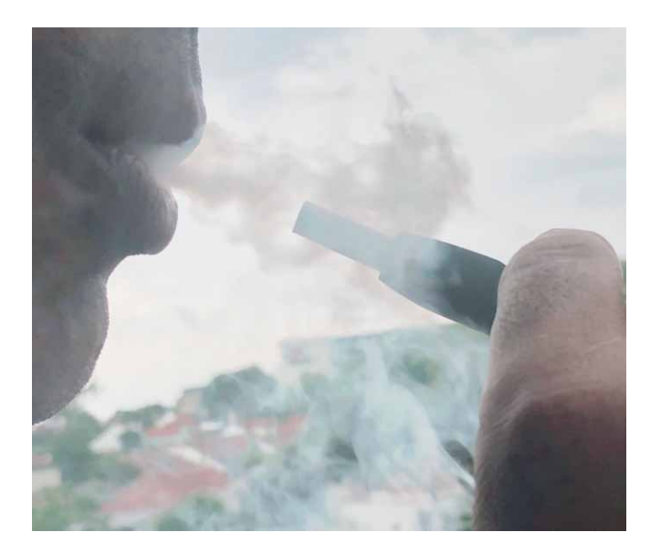
FIGURE 1 Heat not burn devices are becoming increasingly popular. As shown in the picture, these devices generate enormous aerosols that are very similar to the smoke emitted by a combustible cigarette.

The latest nicotine delivery systems to arrive on the market are the HNB tobacco products that have been branded as IQOS by Philip Morris (figure 1). Previous HNB products failed to take off but IQOS is dominating the market. IQOS has just received FDA approval for sale within the USA. In this device, ground tobacco is reconstituted into sheets with water, glycerine, guar gum and cellulose fibres. The tobacco sheets are fashioned into small plugs that are contained within products sold as HEETS or mini cigarettes and inserted into the device where they are heated but not ignited at a temperature of up to 350° C, which generates an aerosol. These devices are still quite new but their rising popularity is spreading