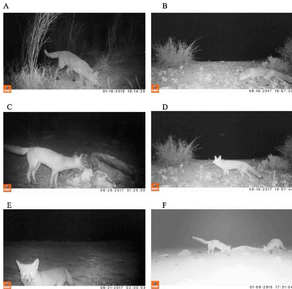
Figure 1. Behaviours observed in this study and used to classify fox behaviour: (A) confident sniffing and walking, (B) cautious sniffing and walking, (C) confident scavenging, (D) high vigilance, (E) cautious camera investigation, (F) social foraging. See supplementary material 1 for an example of behaviourally scored video.

Fox social behaviour comprised of two pairs at two carcasses, lasting in total for 5.10 minutes. Fox pairs spent the highest average proportion of their time sniffing (43%), followed by locomotion (33%) and foraging (27%). During this time, they played (n = 6), greeted one another (n = 5), and scent marked (n = 4).