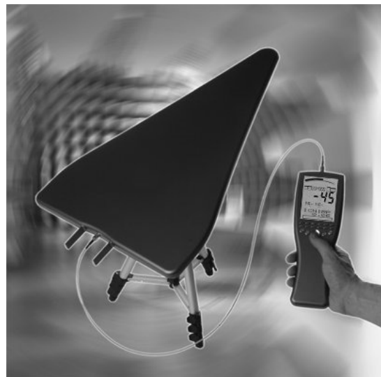
Fig. 2. Spectran HyperLOG Antenna [1].

To explore the radio frequency signatures prevalent in the environment it was decided to use off the shelf components. A Spectran Spectrum analyzer (Figure 2) was employed to detect radiation and their respective signal strengths. The analyzer is manufactured by Aaronia AG. It uses digital signal processing to extract and filter the characteristics of the radio frequencies. It is designed to identify a frequency range of 10MHz to 6GHz.