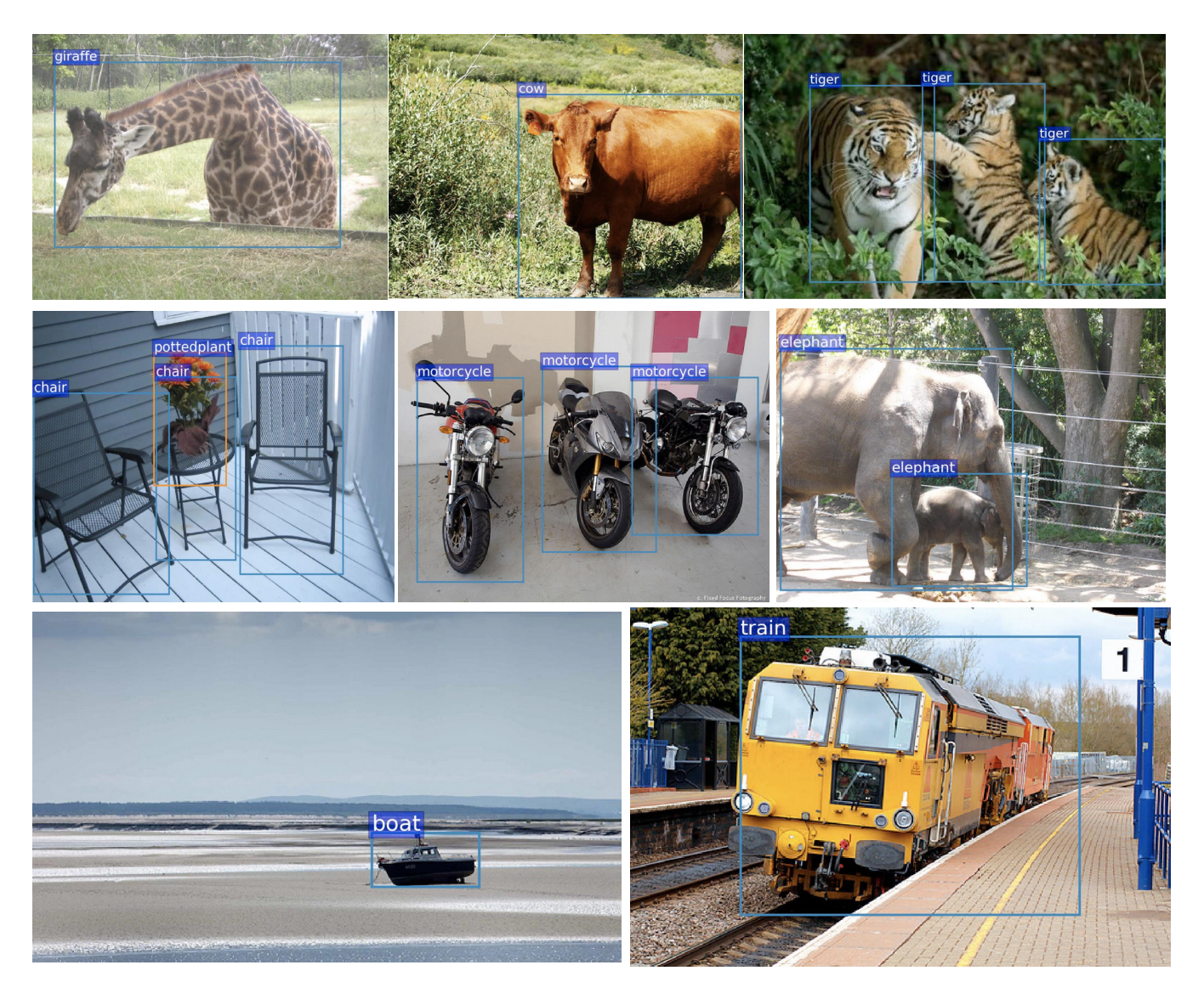
Figure 2: Selected examples of zero-shot object detection. We can see that the detection results are reasonable, which demonstrates the effectiveness of the proposed model for object detection in a zero-shot setting.

the chair and the deck table in this image are visually similar, which makes the system hard to distinguish. In the future, we will continue improving the system to solve this problem.