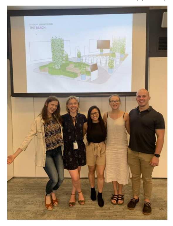
Figure 3: The student services hub team, consisting of staff and student members

wellbeing research and innovation project we hoped to implement a participatory research approach called 'citizen science', an approach used by scientists to involve citizens in research projects (Mitchell et al., 2017), for example bird counting by citizens in ornithological research. Our work in a transdisciplinary undergraduate degree led us to explore what participation meant in different disciplinary contexts (Baumber et al., 2019). We concluded that there were many values and principles that underlie different types of participation and that depend on the context in which the approach is applied. Based on these insights we adopted a 'partnership' approach in the Student services hub project. The language of partnership implies that various stakeholders can contribute different strengths and play a range of roles in the process, with all parties deriving benefits from a mutual learning experience (Kligyte, Baumber, van der Bijl-Brouwer et al., 2019). To strengthen reciprocity and equity in the relationship, students were hired as paid team members on the Student Services Hub team (Figure 3) rather than being engaged as stakeholders as is the case in many participatory design initiatives.