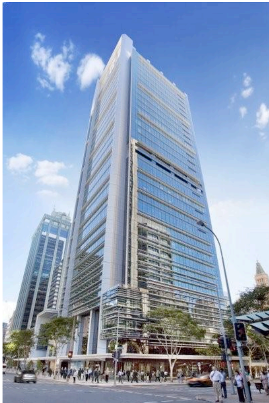
corner of George and Adelaide St.