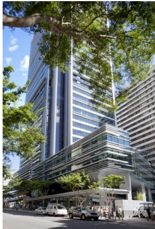
along Adelaide St.