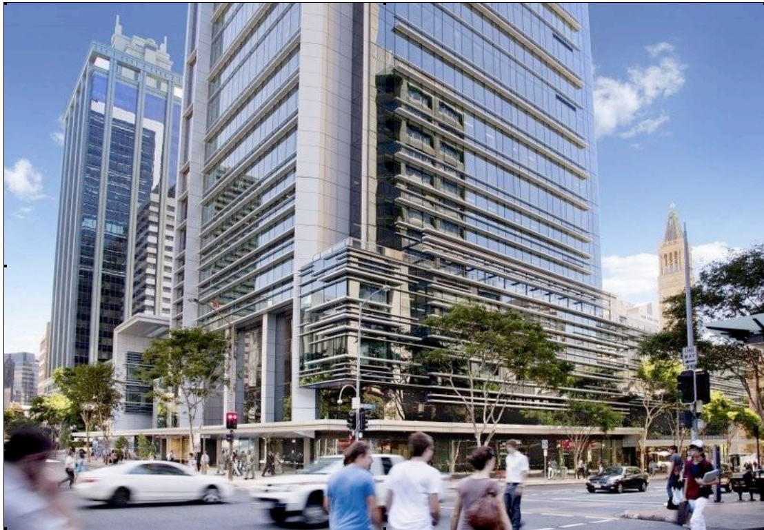
View of completed building from corner of George and Adelaide St, Brisbane