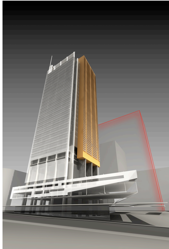
early concept image, Adelaide St.