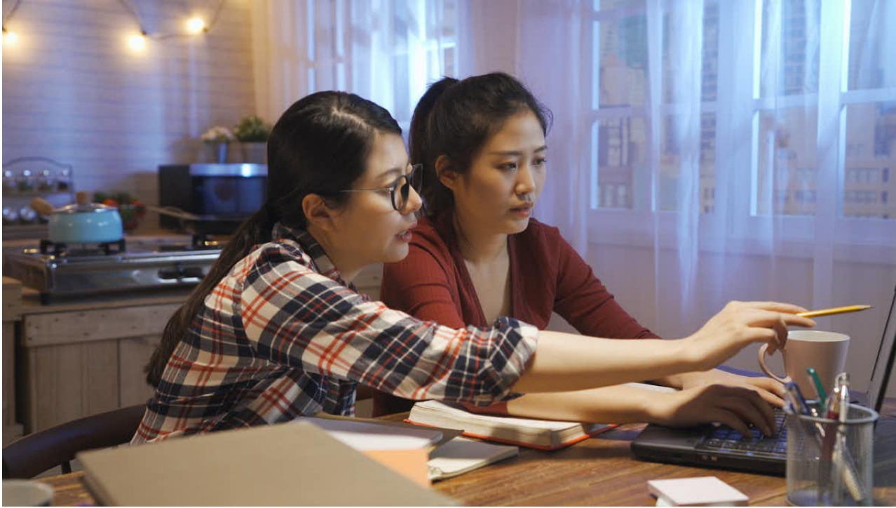
In some share houses, all the students have lost their jobs and don't know how they'll pay the rent.