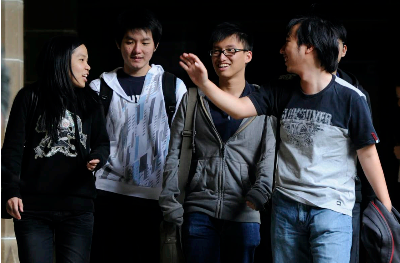
The loss of social contact on campus has left international students feeling very isolated.