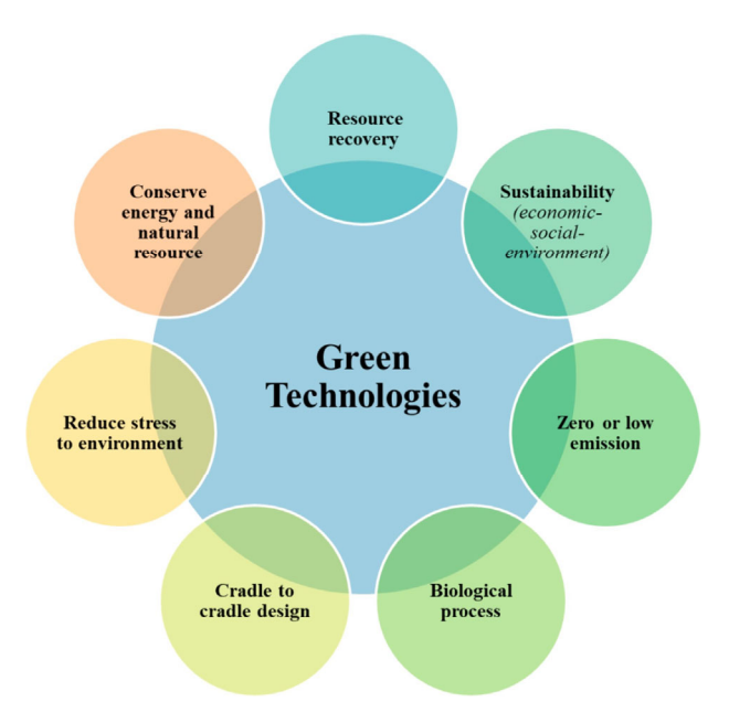
Fig. 1. Principle of Green Technologies for water and wastewater treatment.