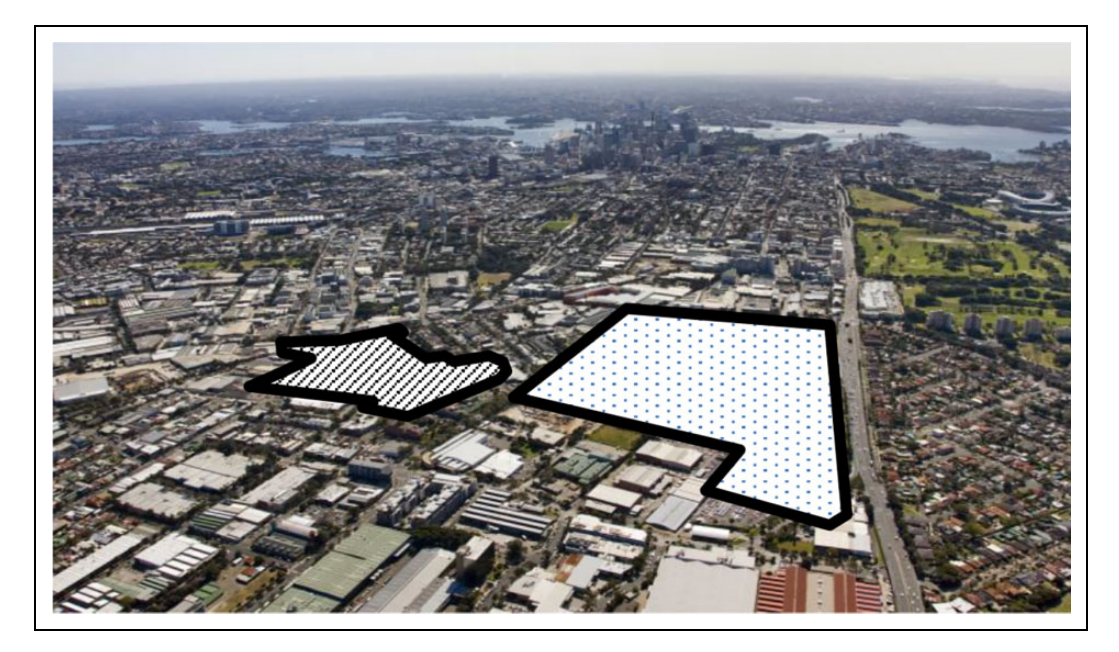
Figure 1. Delineation and context of Victoria Park (stiple) and the Green Square Town Centre (hatched). The Sydney CBD is located in the middle distance.

The Green Square Redevelopment Area itself comprises 278 ha and was defined in the mid-1990s to capitalize on the opening of a new railway station. The intention is to create a new urban neighborhood of some 30,000 residents and 15,000 workers by 2030, supported by a massive investment in new public infrastructure. Over the intervening years, there have been various changes in local government and state government authorities responsible for the area. Although adding another layer of complexity to the development of the area, these changes are not canvassed here for the sake of brevity.