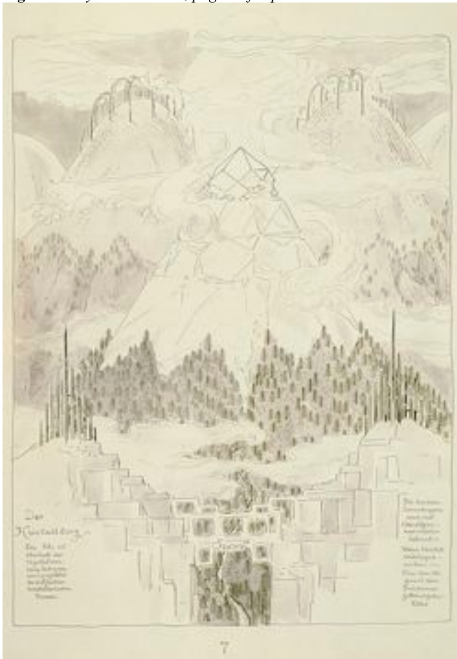
Figure 6: Crystal Mountain, page 7 of Alpine Architecture.

The new world Taut imagines is fanciful and magical. He renders the architecture in pastel hues, with an abundance of bright yellow that