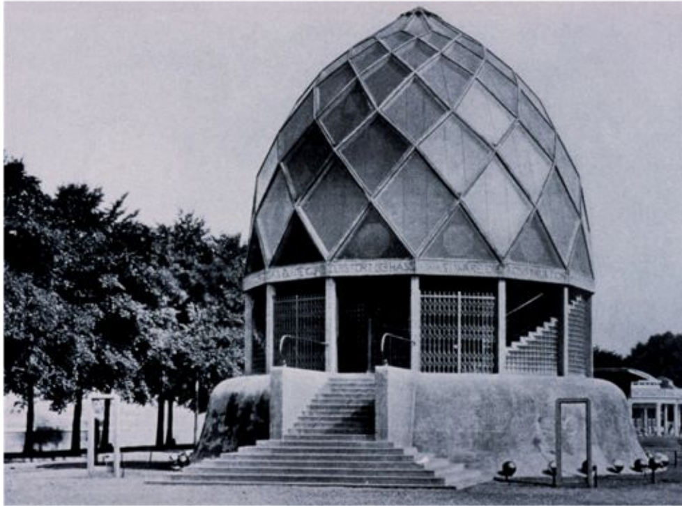
Figure 3: Glass Pavilion, Cologne Werkbund Exhibition (1914)