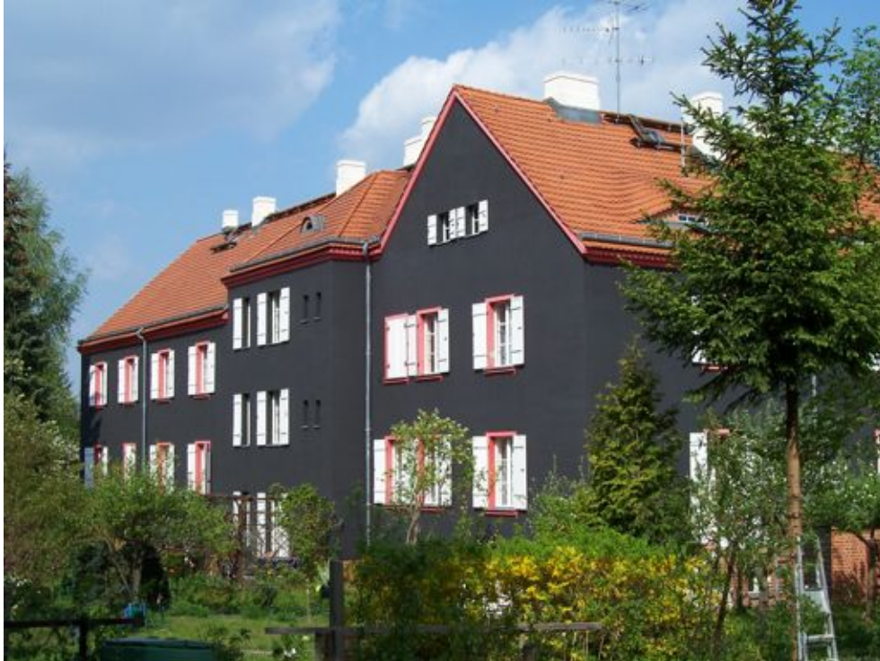
Figure 1: Am Falkenberg development (1913-1916)

In Taut's case, the war experience seems to have given him license to intensify the more radical aspects of his work; the aesthetics temporarily become fantastic and utopian and the social project becomes extreme. From the uninspired architectural pragmatism of Falkenberg (1913), that was steeped in conventional social improvement aspirations, Taut turned to the fantasy and speculation of Alpine Architecture (1919), the City Crown (1919), Architecture for a New Community (1920), and the Dissolution of the Cities (1920). (Figure 1) Of special interest here is Alpine Architecture because Taut considered Alpine Architecture an anti-war manifesto; the communities and architecture he envisioned are not only ideal but also respond in very pragmatic ways to conditions caused by the First World War. Taut uses Alpine Architecture as an antidote to war. Build rather than destroy, is part of the tract's message, but also Alpine Architecture presents construction of utopian communities as the alternate channel for the human impulses and energy expended on war. At the same time, the project presents an alternative world to the reader, one where problems, like war and conflict, will be eradicated by the effort required to construct the spectacular architecture and by the sheer wonder that architecture and the natural landscape in which it is situated will instil in people.