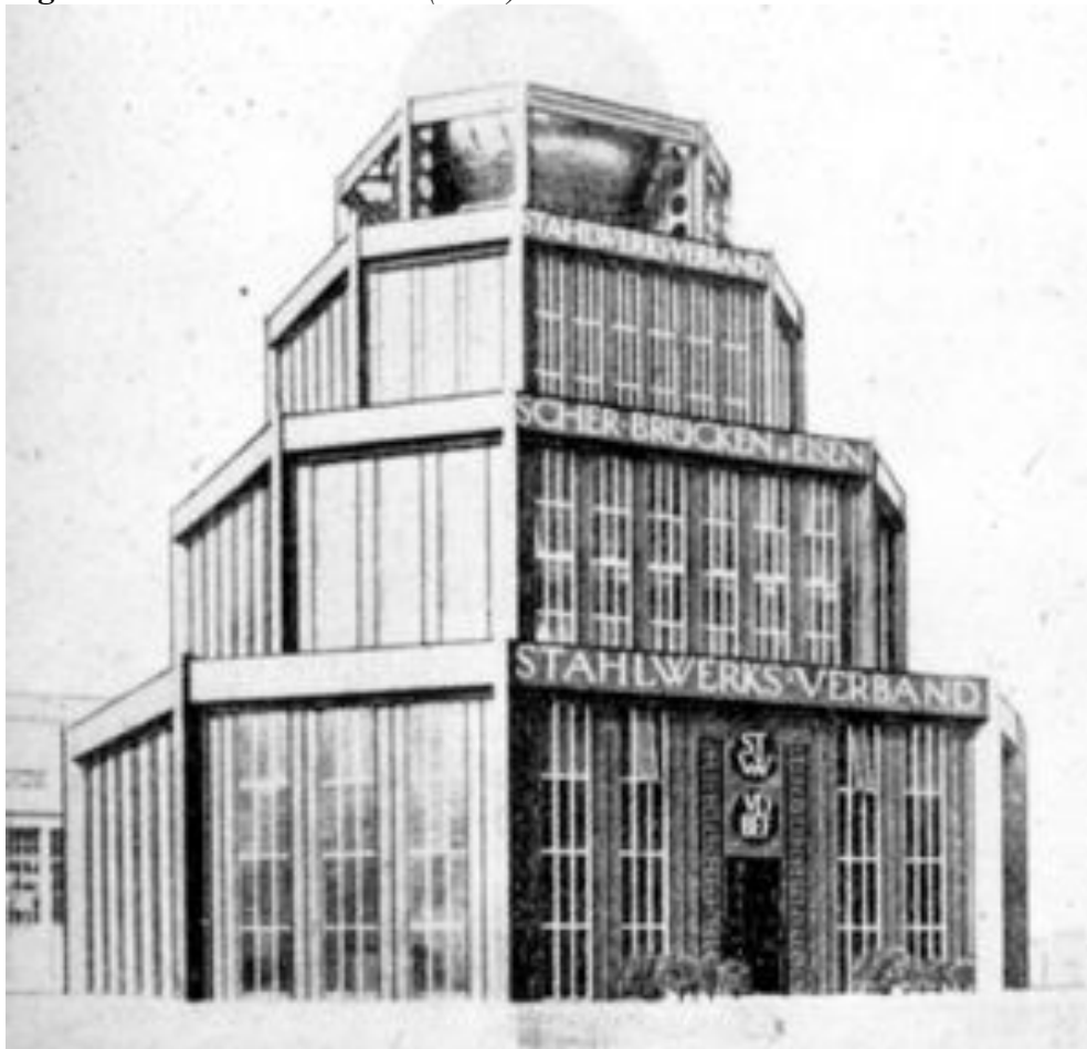
Figure 2: Monument to Steel (1913)

by architects like Peter Behrens. 19 The monument is a four-tiered octagon, which the famous architecture critic Adolf Behne considered “Cubist.” Each tier is smaller than the one below so that the volume sets back as it rises off the ground. A gigantic gold sphere sits inside the uppermost openwork lattice tier quite like the dome atop the Cologne Glass Pavilion, only smaller and spherical. It recalls Joseph Maria Olbrich’s Secession Building in Vienna as well as other historical domes. The tiers are ringed bands of floor-to-ceiling windows making the interior as filled with natural light as possible. Taut placed exposed steel columns on the outside and inside to advertise the pavilion’s function, as a showcase for steel construction. At each level, inscriptions wrap around the building. The inscriptions list steel structures like bridges and factories and also list the names of professional steelworkers groups like the Steel Mill Association. In plan, the monument is symmetrical and centrally organized with an inner space surrounded by a ring of open space. The structure therefore anticipates the Cologne Pavilion in several formal moves.