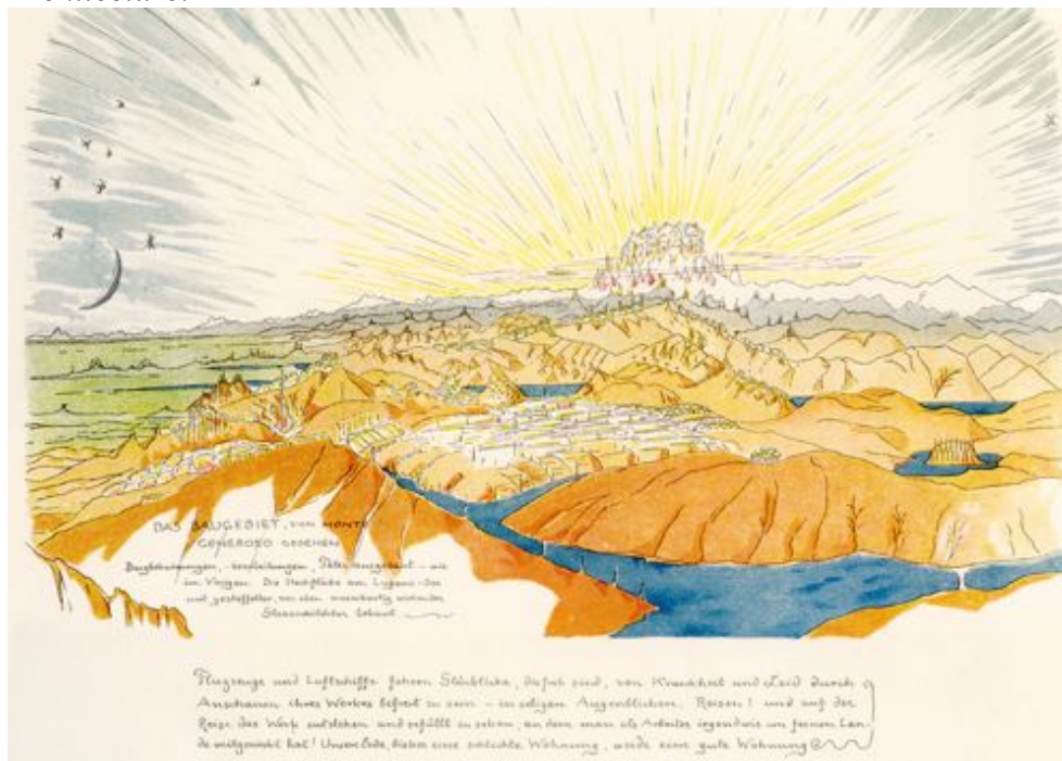
Figure 4: The Building Area on Monte Generoso, a page from Alpine Architecture.

The preface to Alpine Architecture was not included in the published edition. It reveals Taut's intentions. In it, Taut begins by dedicating his work to Scheerbart. Taut writes, "the deepest reason for its [ Alpine Architecture 's] emergence lay in the heart of its creator – a heart that shed blood under all the pain of war in the world." 26 And, in a letter to his brother