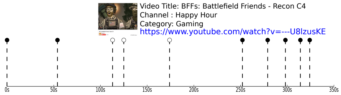
Figure 1.1 An point process, showing tweets about a Gaming video on Youtube. The first 10 events are shown. They correspond to the first 10 tweets in the diffusion, the time stamps of which are indicated by dashed vertical lines. An event with hollow tip denote a retweet of a previous tweet.

Point processes are collections of random points falling in some space, such as time and location. Point processes provide the statistical language to describe the timing and properties of events. Problems that fit this setting span a range of application domains. In finance, an event can represent a buy or a sell transaction