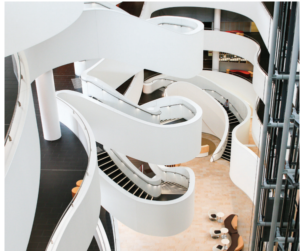
Charles Perkins Centre

This new information is further supported by the findings of additional research into some individual events that have taken place over the last few years. Together, this data provides clear evidence of the enormous legacy of business events and long-lasting effects of the outcomes they have facilitated.