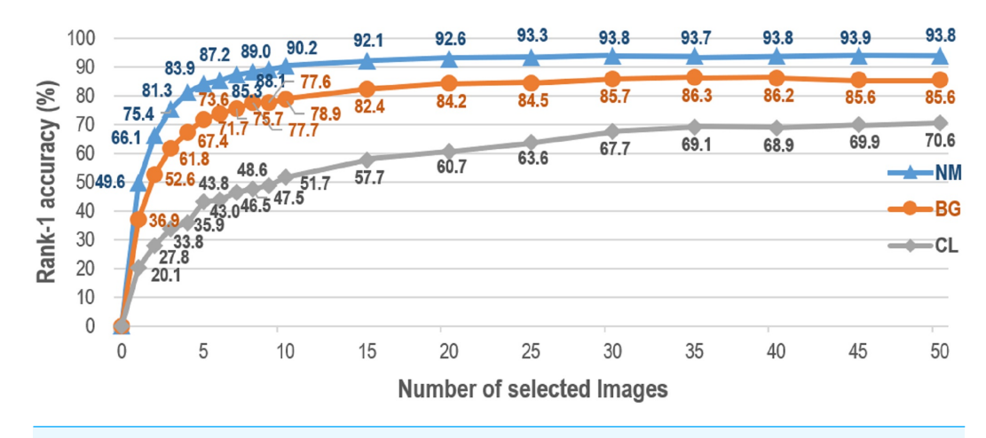
Figure 1 Average rank-1 accuracies with constraints of silhouette volume on CASIA-B in the setting LT. Accuracies are averaged from all views excluding identical-view cases across 10-times experiments. Full-size DOI: 10.7717/peerjcs.382/fig-1

dropped accuracy of 87.2% when taking a small number of only seven silhouettes as the input. For GaitSet, each input silhouette is independently processed in the shallow layers. In order to aggregate the features of each silhouette into a feature of the whole input sequence, a set pooling function is specially utilized to select the most discriminative parts from each processed silhouette. As more input silhouettes can be utilized, a more complete description can be generated for each sequence, and the discrimination capability of GaitSet can be gradually increased. On the other hand, for the cases of only a few silhouettes being utilized, the discrimination capability of GaitSet can be remarkably decreased. This is because these silhouettes can only occupy a small proportion of each input whole sequence, and the aggregated features cannot establish a comprehensive description for each sequence. Hence, it has become an urgent problem for gait recognition how to achieve a robust performance when only a few input frames can be offered.