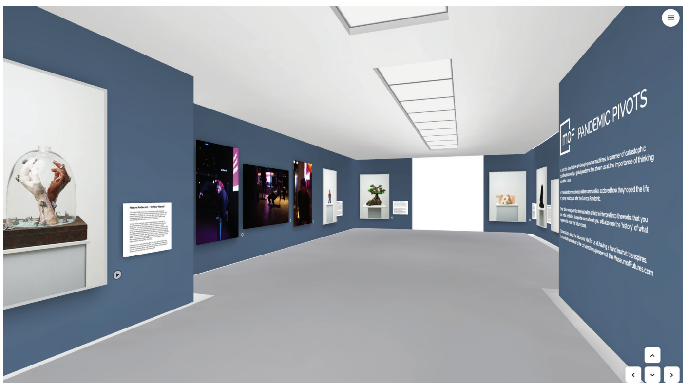
Image of Virtual Gallery below. Virtual gallery can be visited at www.museumoffutures.com