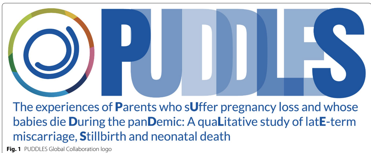
Fig. 1 PUDDLES Global Collaboration logo

For countries participating in the on-line survey study, who also opted to participate in the PUDDLES Global Collaboration qualitative interview study, there was a page at the end of the survey for bereaved parents to leave contact details to indicate willingness to take part