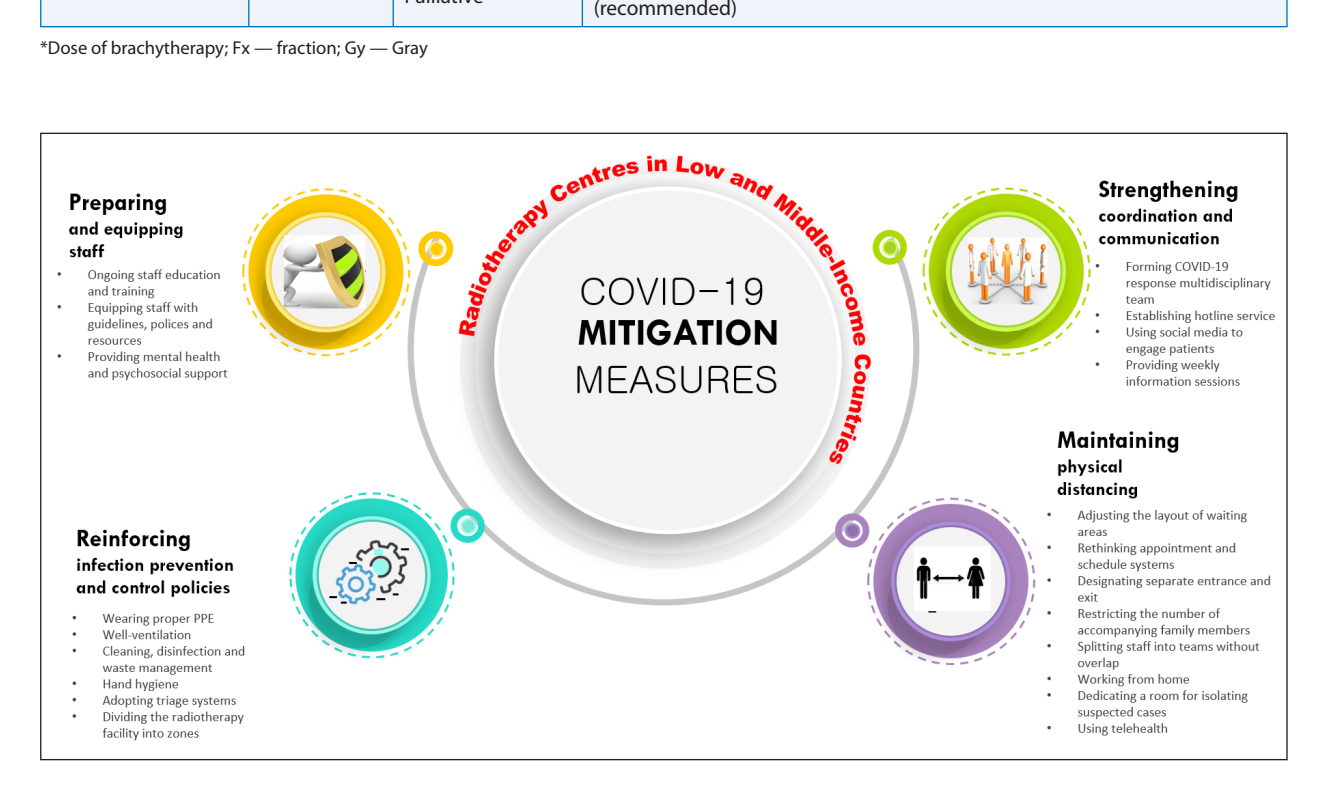
Figure 2. COVID-19 mitigation measures adopted by radiotherapy centres in LMICs

*Dose of brachytherapy; Fx — fraction; Gy — Gray