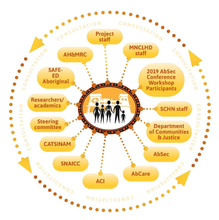
Figure 1. Daalbirrwirr Gamambigu Aboriginal consultation diagram.

base for the project; findings from the literature review and yarning groups; and their own experiences and knowledges working with Aboriginal communities. These reflections were sketched onto large sheets of paper, organised into categories, and mapped back to the core artwork. After four iterations of this process, the artist converted the design into the diagram for further consultation.