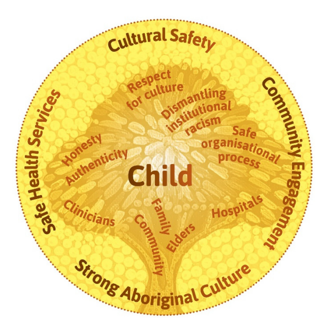
Figure 2. Daalbirrwirr Gamambigu thematic diagram.