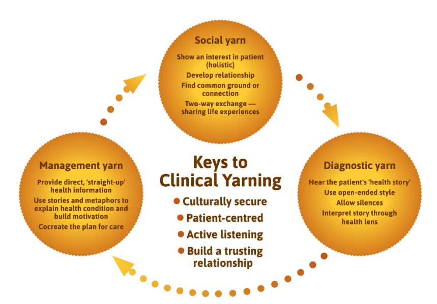
Figure 4. Keys to clinical yarning (adapted from Lin, Green and Bessarab (2016)).

The clinical yarning model (Figure 4) was adapted from the work of Lin, Green and Bessarab (2016) and illustrates the key elements to effective communication between health professionals and Australian Aboriginal families [65].