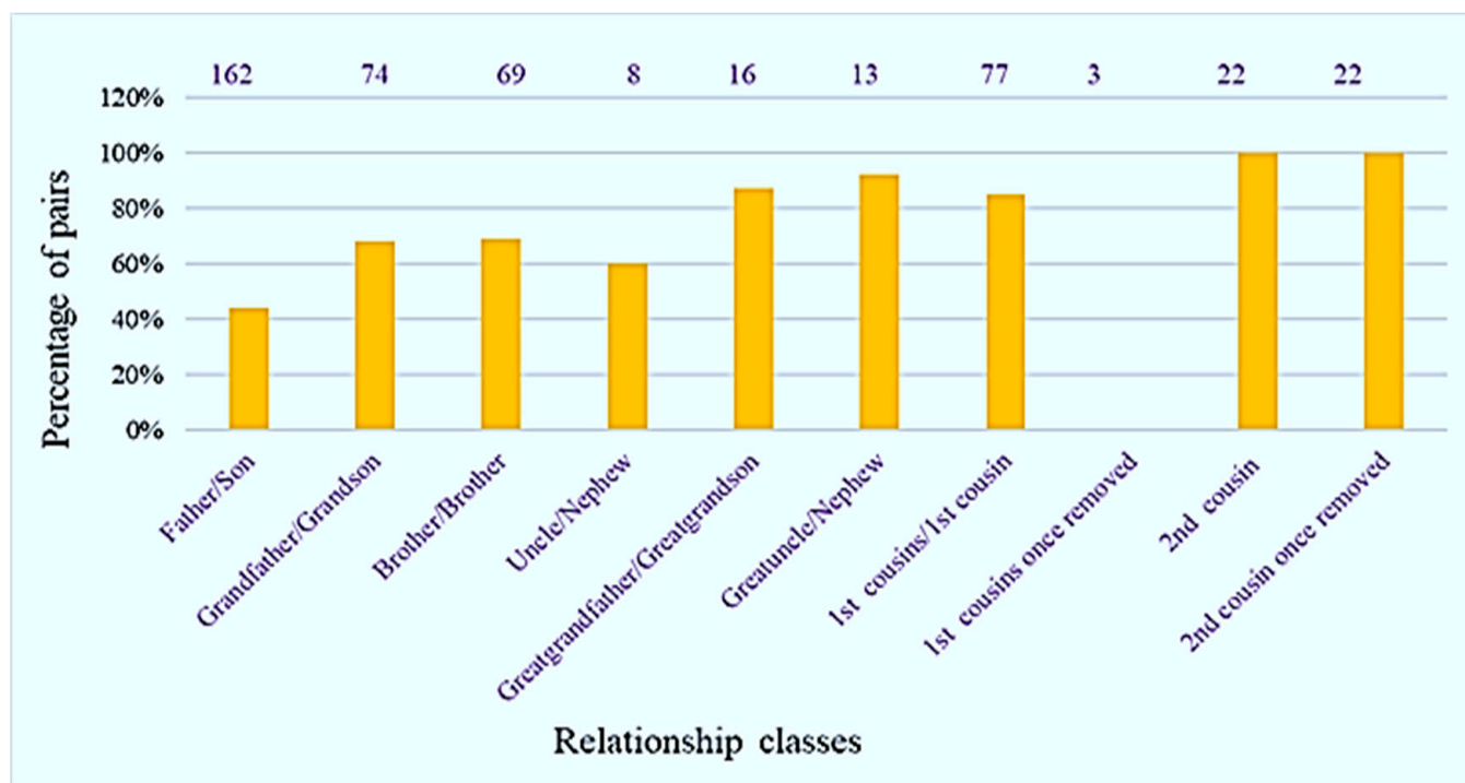
Figure 2. Pairs of male paternal relatives ( n = 536 ) separated by one to seven meioses with at least one mutation. Values above the bars represent the total number of pairs for each relationship class.