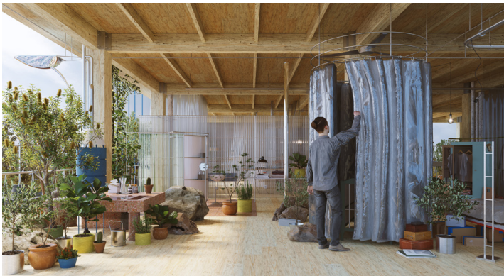
Figure 1 The future of Gen Z and millennials' living

closet shows a selection of normcore clothing, similar to those the young man by the curtain wears. In the front, the B22 , a lamp designed by Maarten van Severen has been left turned on (van Severen, 1997). To the left, a red terrazzo low-table that could have been designed by Besler & Sons SSL as part of their Props collection (Besler & Sons, 2018), holds heterogeneous objects: kitchen utensils, a bottle of Aesop soap, canned food, a white box of paper tissues, a large blue water tank, and several tiny puddles. This relaxed attitude toward occupation, akin to Sam Chermayeff's Creatures , extends to the rest of the room (Küng, 2020). Traces of life appear in the disorganised piles of unopened cardboard boxes, books and magazines, and objects randomly left behind after being used, such as the watering can and the lit light bulb.