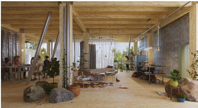
Figure 2 Sharing life (Image by authors)

Two topics guided the first section of the research: Australia's unaffordable city real estate market and the gradual dissolution of the nuclear family. In Sydney, hundreds of thousands of people live in shared apartments. Many students, workers, and young professionals can only afford a house by sharing costs, life and space. 3 Sharing a home is more common among Gen Z and millennials. Friendship, new family structures, informal agreements, and collective dinners outline ownership models yet to be translated into the marketplace. The following contemporary projects explore new forms of sharing life, propose alternative ownership models, and question who might cohabitate and how they could arrange a life together (Figure 2).