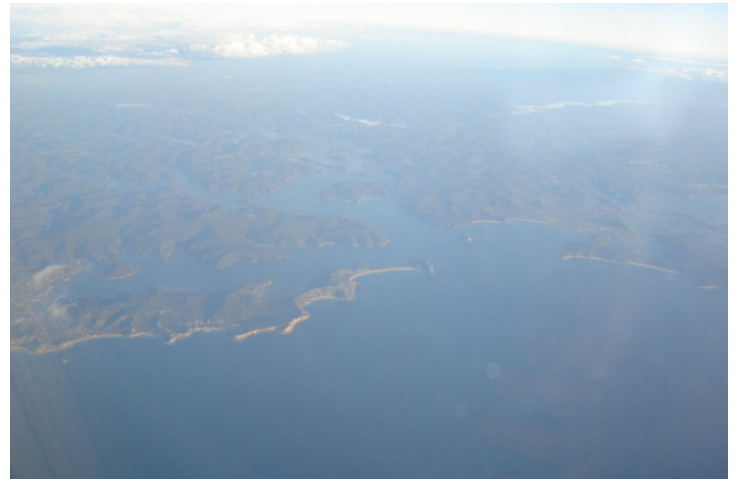
Right: Aerial view of Broken Bay, directly north of Sydney