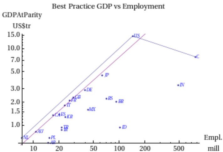
Fig. 2 GDP at Parity versus Employed Persons with best practice envelope and constant scale trajectory

Figure 2 shows how Australia compares to other countries in terms of GDP at purchasing power parity and Employment. Australia (AU) is nearest but one (NL) to the plot origin. An envelope of best practice is drawn from The Netherlands (NL) to the USA (US) and from the USA (US) to China (C).