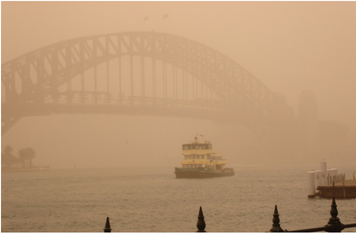
Left: Sydney Harbour Bridge during the September 2009 dust storm