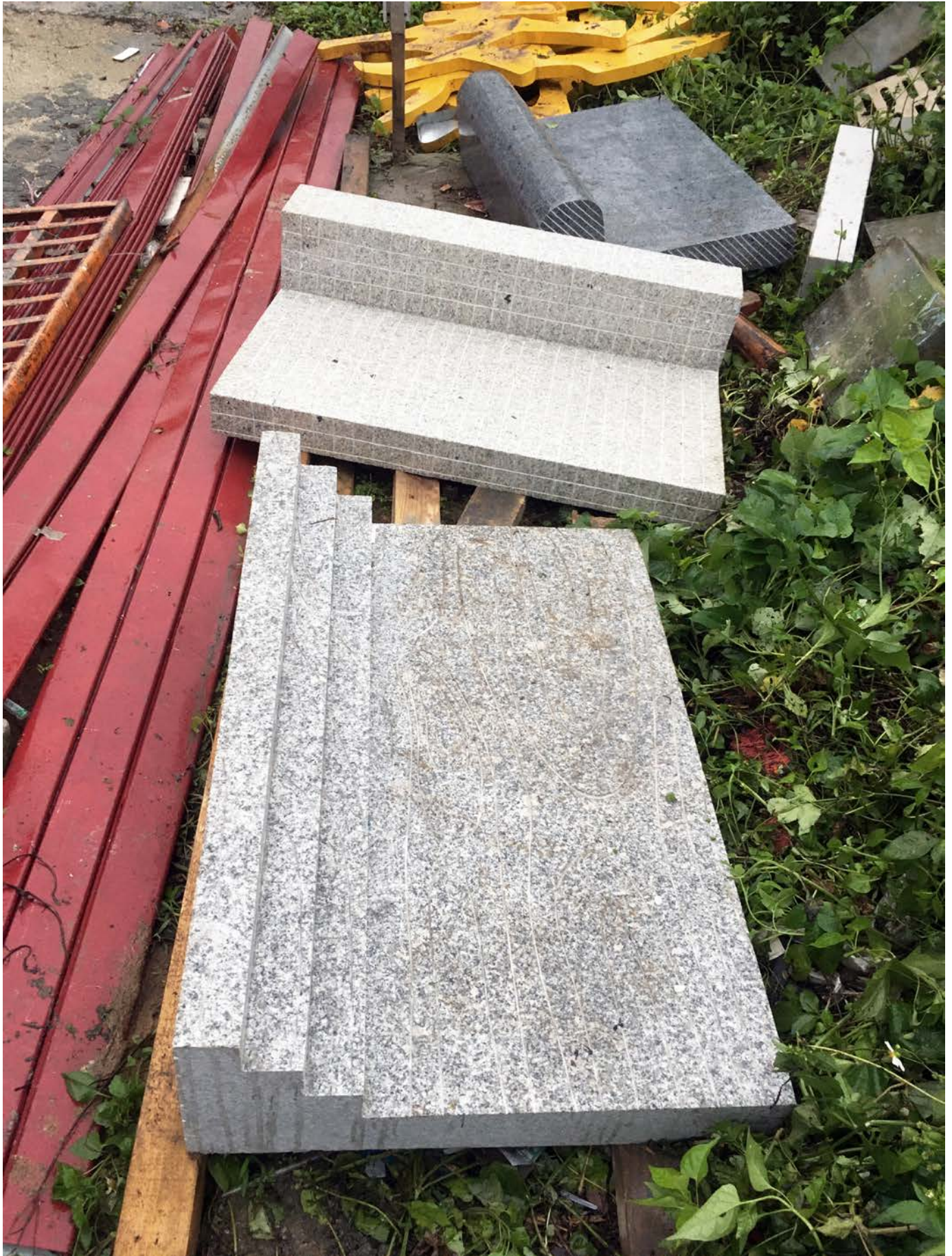
Kerbs arriving to the Bi-City Biennale of Urbanism and Architecture 2019 'Eyes of the City' (Shenzhen, 2019)