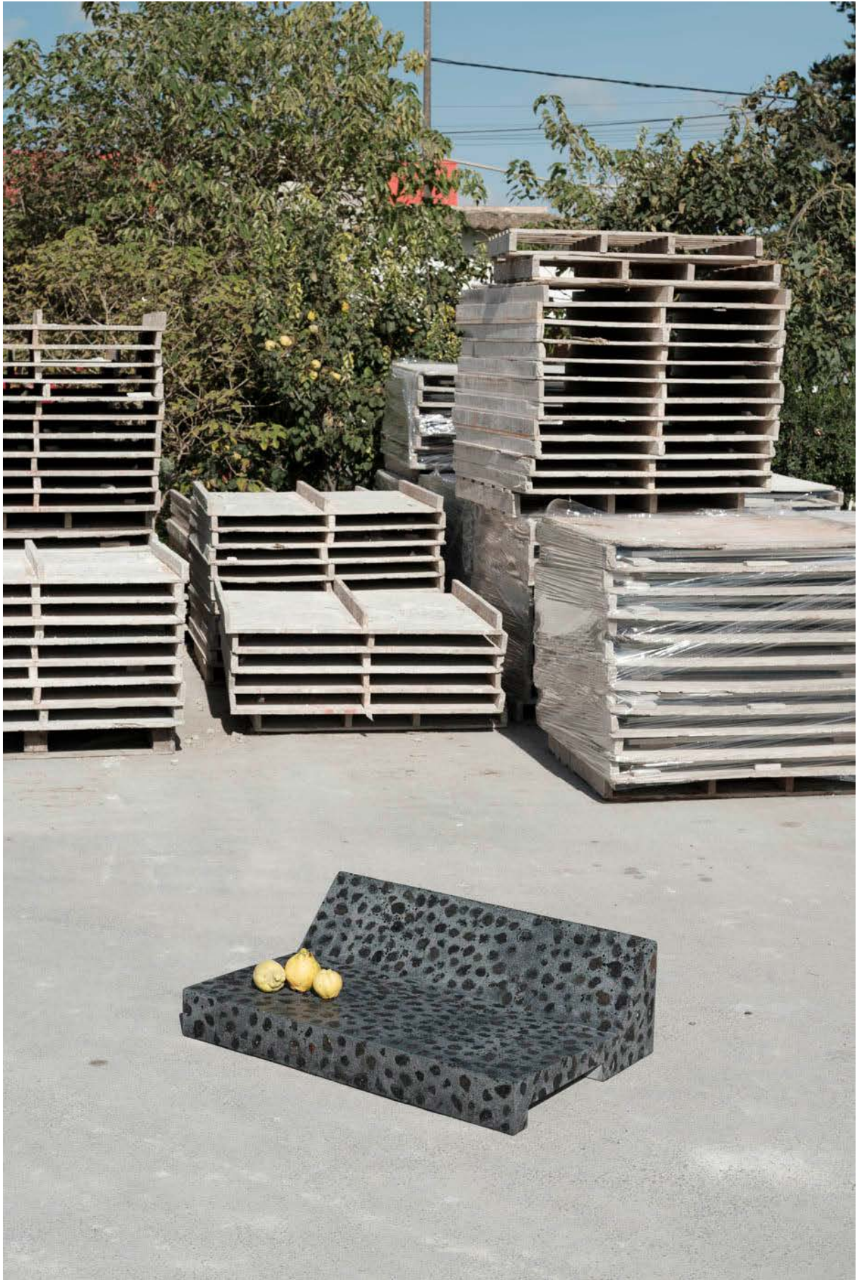
Black Kerb at the production site a Huget factory