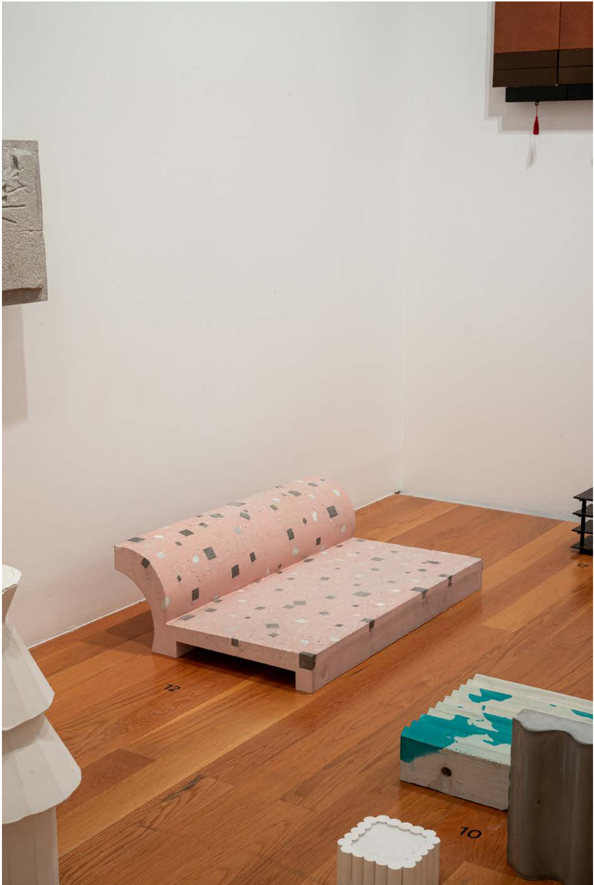
Pink Kerb at What is Ornament at the Lisbon Triennale 2019 (Lisbon, 2019)