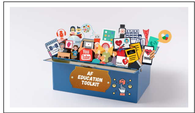
Figure 1. Atrial Fibrillation (AF) education toolkit.

Other research has explored patients’ preferences for AF education. Our findings are similar to those of McCabe and colleagues, who identified that verbal and written resources were the most commonly used tools to educate patients about their AF, along with video and multimedia resources. 19 Participants who were familiar with accessing digital resources, endorsed modules, or professionally moderated virtual