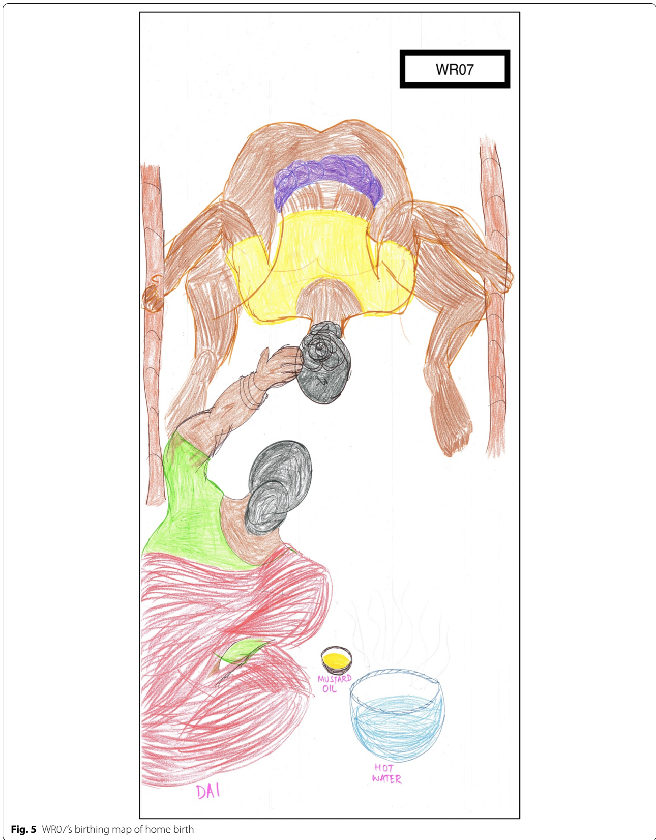
Fig. 5 WR07's birthing map of home birth