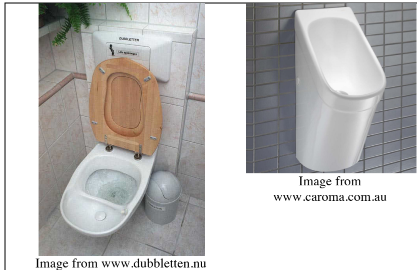
Figure 1. An example of a urine diverting toilet and waterless urinal

The project will take tangible steps towards closing the nutrient loop by retrofitting a male and female toilet block on the UTS campus with a number of urine diverting toilets and waterless urinals. Urine collected from the installed toilets will be tested as a substitute for phosphate and other fertilisers in a small-scale agricultural trial during the study. Figure 1 shows examples of such toilets.