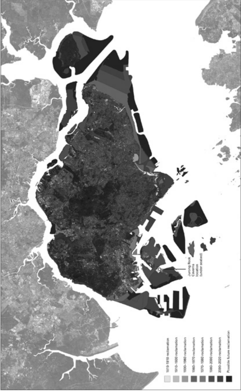
Figure 2.1. Singapore's history of land reclamation.