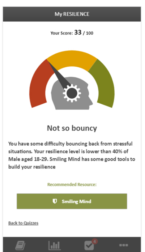
B) Normative feedback

The World Health Organization (Five) Well-Being Index [20] is a commonly used measure of subjective wellbeing. Five items produce a score ranging from 0 to 25, with higher scores indicating better quality of life. Using the population mean as the center, scores between 0-12 were considered as low wellbeing, and scores between 13-21 were considered moderate wellbeing.