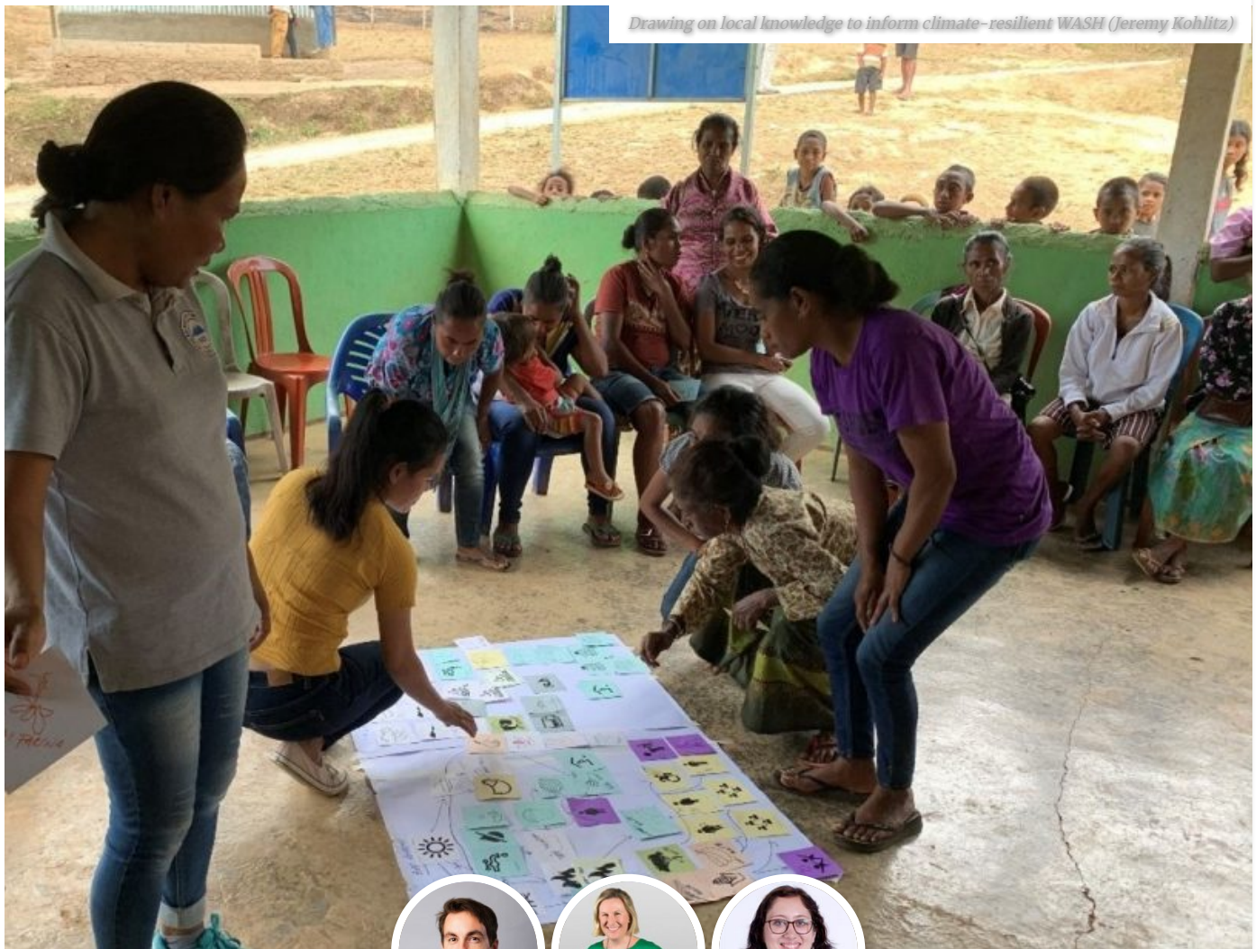
Drawing on local knowledge to inform climate-resilient WASH