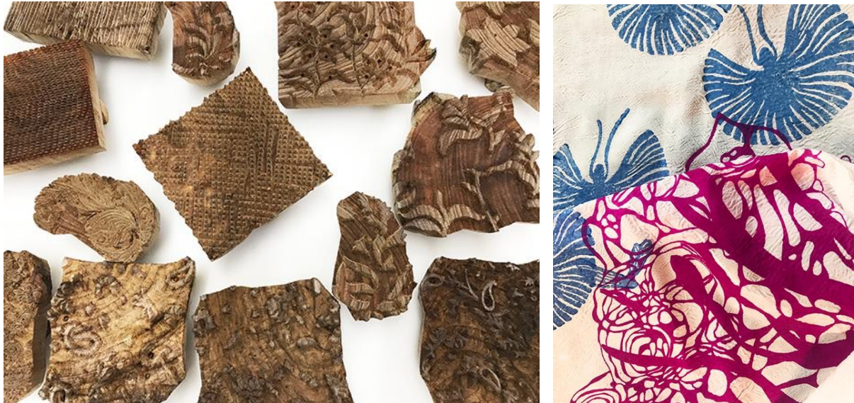
FIGURES 6 AND 7. Copies of Tharangini archival woodblocks were commissioned for students to explore on campus at UTS Sydney (figure 6) Emerson White student woodblock design combines silkscreen printing (figure 7).

commissioned from Tharangini on natural dye and print processes. A selection of woodblocks from the Tharangini archive was copied for students to learn woodblock printing (Figure 6), where students first gained a haptic understanding of the print process and then had the opportunity to design their own woodblocks. In addition, silkscreen printing was also introduced alongside their woodblock design. Overlaying these two print technologies produced innovative results that the artisans found fascinating, as discussed below (Figure 7).