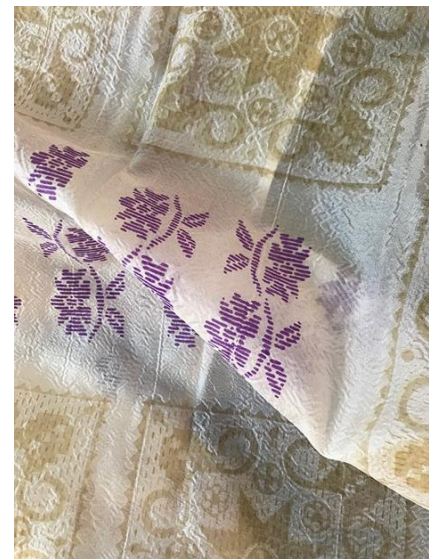
FIGURES 8 AND 9. Student woodblock designs hand carved by a master artisan, artisan names at Tharangini Studio (figure 8). Kat Kovats student woodblock and silkscreen print of grandmother's embroidered scarf, natural and acid dye print (figure 9).