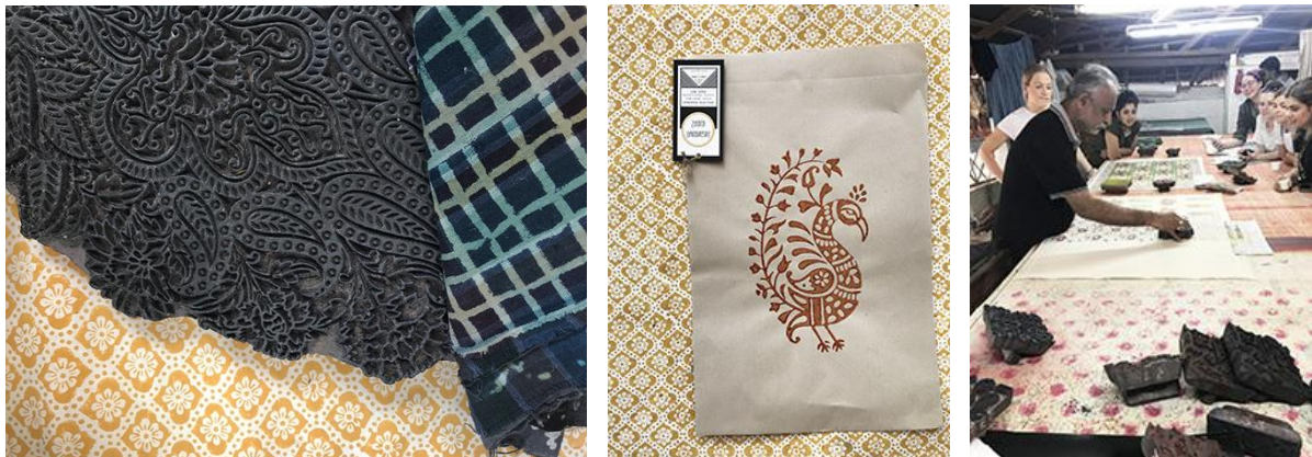
FIGURES 1, 2 AND 3. Tharangini archival woodblock and print (figure 1); Tharangini logo (figure 2); Artisan Krishna woodblock print demonstration with UTS fashion and textile students, Tharangini studio Bengaluru (Bangalore) 2019 (figure 3).

Due to recent world events caused by the pandemic, artisanal woodblock studios worldwide paused from 2020 to 2023, during which time the author was challenged to adapt the broader university textile curriculum to online learning. While there were challenges in this new digital teaching space, she discovered that the design outcomes from student work were still high in quality. However, problems associated with social isolation arose due to the lack of physical human interaction that face-to-face