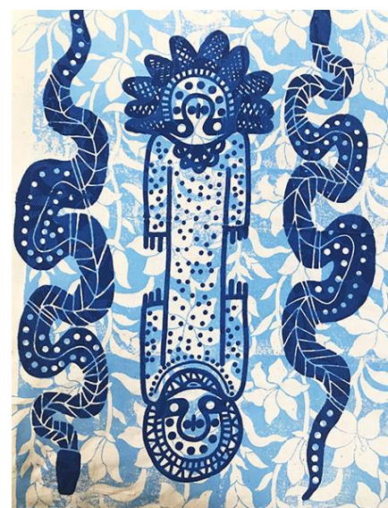
FIGURE 10 and 11. Indigenous UTS student Sharniqua Oxtoby silkscreen print combined with Tharangini texture woodblock (figure 10). Oxtoby silkscreen print combined with Tharangini archival floral woodblock (figure 11).