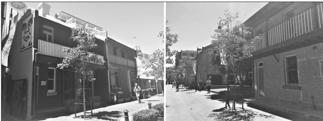
Figure 2: Kensington Street Cottages in Central Park, Sydney, AU, March 2018.

if you take the blunt view on the return per square metre, it probably doesn't stack up [... but] it was a huge selling tool for the apartments.