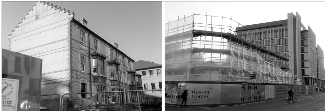
Figure 3: CB1 Development, Cambridge, UK: (left) Wilton Terrace before demolition, November 2016; and (right) Wilton Terrace's replacement new office building, March 2019.

family housing rather than larger new builds with apartments and/or studios (Gemeente Eindhoven 2010). For this reason, a seven-storey former office block described as the Strijp-R's 'most striking building' (van der Hoeve 2006: 169) was considered out of character with the proposed development as it was too tall, and was demolished. Therefore, on each case study site the retention versus demolition decisions related to their massing and scale in the context of the target market, which in turn was affected by the economic conditions of the area.