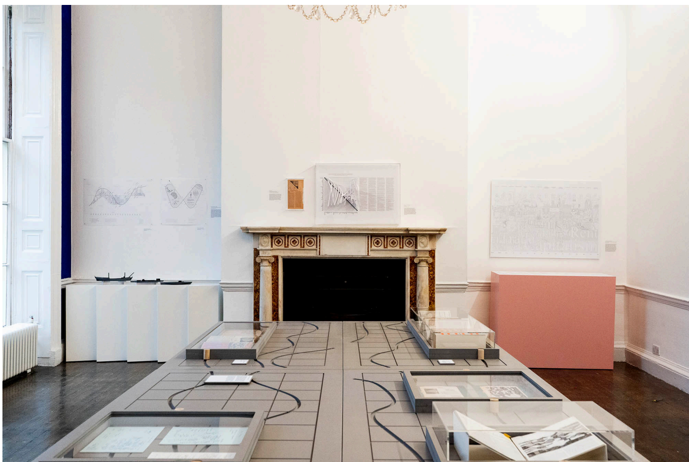
View of the Chronograms of Architecture exhibition at the Members' Rom at the AA

The End of Prediction 1 / 5 Urtzi Grau and Francesca Hughes