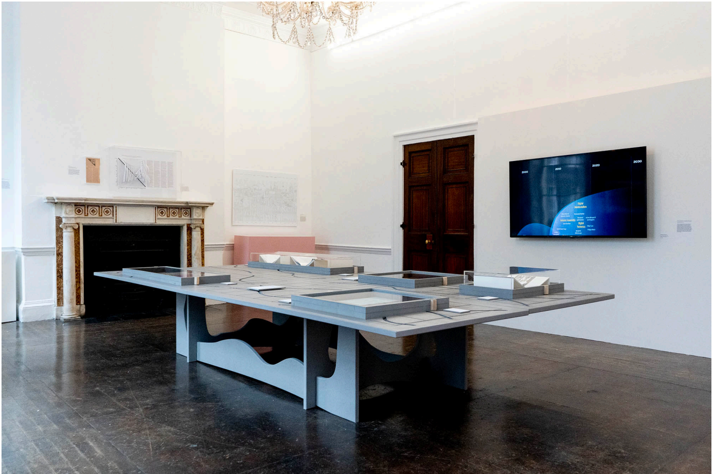
View of the Chronograms of Architecture exhibition at the Members' Rom at the AA