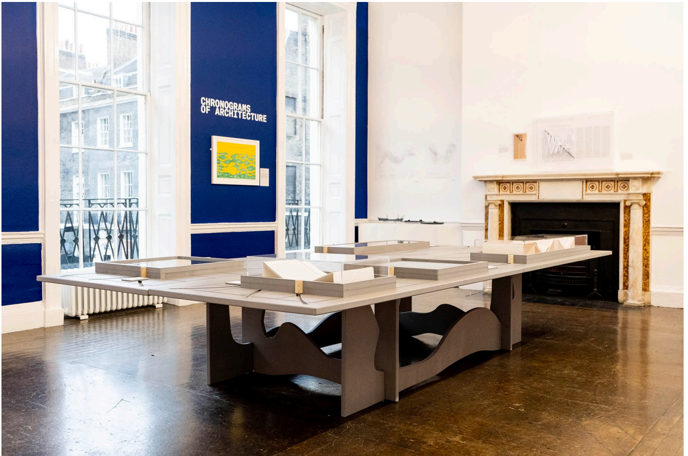
View of the Chronograms of Architecture exhibition at the Members' Rom at the AA Image Elena Andreea Teleaga