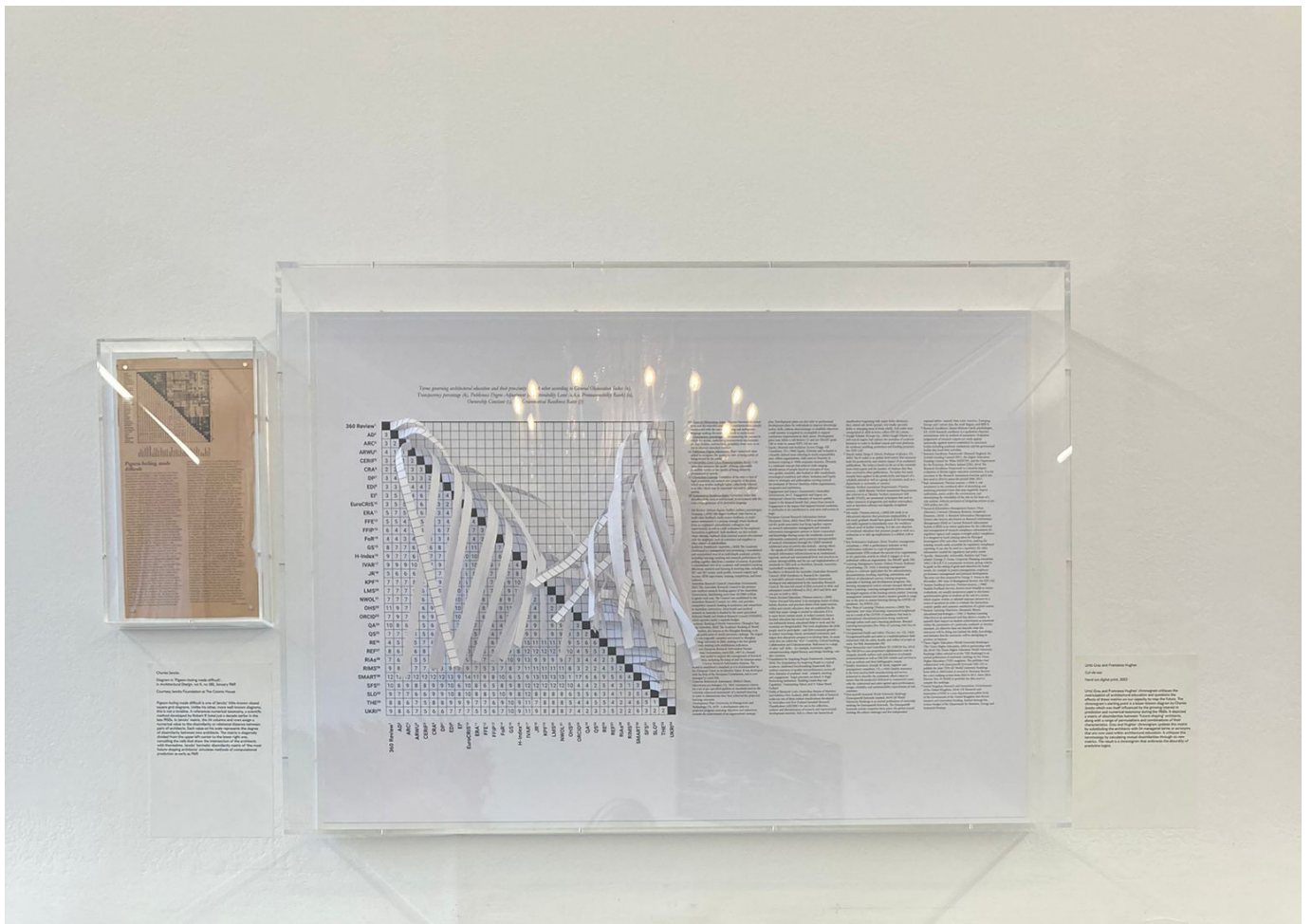
View of the End of Prediction at Chronograms of Architecture exhibition in the Members' Rom at the AA Image Elena Andreea Teleaga