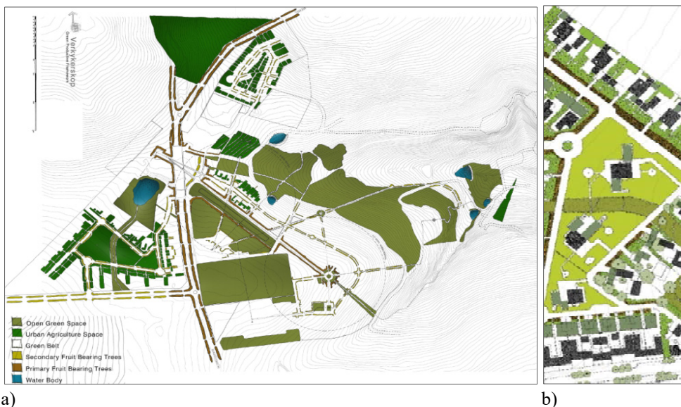
Figure 2: Green framework (a); Production and processing in the residential component (b).

The proposed residential component [24], [25], pertinently reflecting the regions' vernacular architecture (Fig. 1), is measurably not monofunctional and commodity and non-commodity [11], production (Fig. 2(b)) and processing (Fig. 3 (b)) are permitted. All buildings are pre-planned [60], incorporating energy-efficiency [6] and employing green architecture and ecosystem services (Fig. 3 (a)) [14]. In denoted areas, guest houses are intrinsically permitted [29], augmenting the region's tourism basis [53].