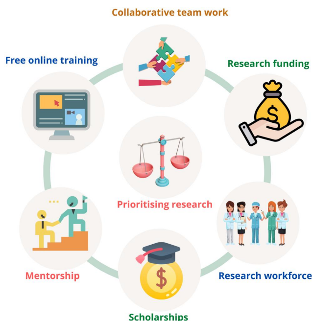
Figure 1. Strategies to promote high-quality research in low- and middle-income countries.

[16–20]. Selected publishers also waive publication fees for authors from LMICs to assist in open-access publishing.