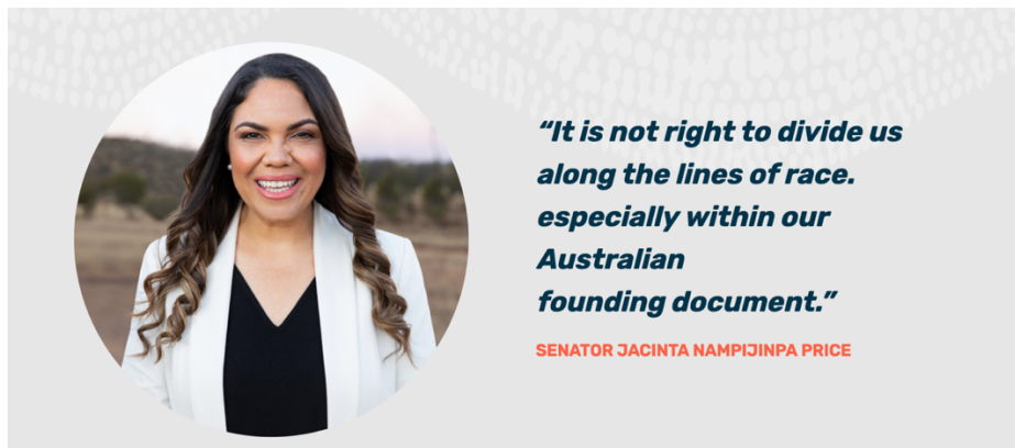
Screenshot: Fair/Advance Australia 7

On the same day as the defeated Voice referendum in Australia, a national election was held in Aotearoa/New Zealand. With the recent change of government to the right in New Zealand, the radical right wing National coalition partner the ACT party, led by David Seymour, is now running a carbon copy campaign to try and bring about a referendum on Māori co-governance and the long settled constitutional recognition of the 1840 Treaty of Waitangi, citing polling by the Atlas thinktank New Zealand Taxpayers Union. 5 ACT's election campaign slogan "End division by race" will sound very familiar to Australians. 6 Of course there was no mention of 'race' in the proposals of the 2017 National Constitutional Convention, the Uluru Statement for the Heart, or the constitutional discourse on the Treaty of Waitangi. The term was surely deliberately introduced by Atlas thinktanks precisely to foster and license racial discourse (e.g., to encourage racism), the better to 'divide us on the basis of race'.