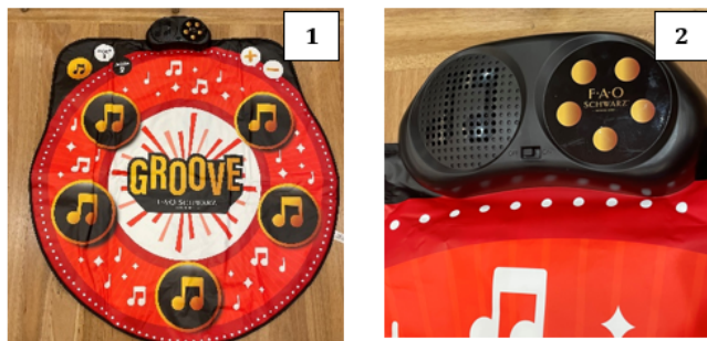
Figure 7: The FAO Schwarz – Toy Dance Mixer Rhythm Step Playmat, (1) the toy set-up, (2) the instruction panel.