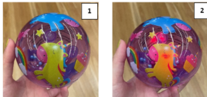
Figure 6: The Hello Sunshine Light Up Sensory Ball, (1) with lights turned off, (2) with flashing light.