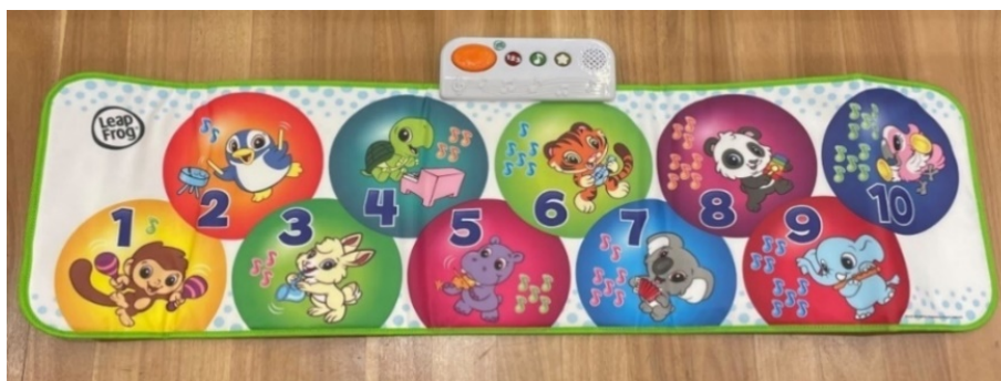
Figure 2: The LeapFrog Learn & Groove Musical Mat