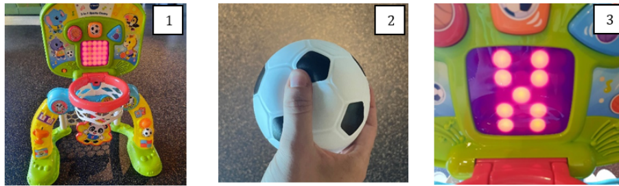
Figure 3: The VTech 3-in-1 Sports Centre, (1) toy set-up, (2) soccer ball, (3) light-up LED screen that can display scores in response to children kicking goals.