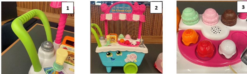
Figure 1: The LeapFrog Scoop & Learn Ice Cream Cart, (1) pushing handle, (2) toy set-up, (3) ‘ice cream ingredients’ that can be interacted with through fine motor interactions.

The study began by examining online catalogues, toy stores and department stores (e.g., Target, Toyworld) for toys that would adhere to the criteria outlined above. From there, we expanded our searches by also exploring typical makers of children’s toys such as LeapFrog and Vtech Electronics. As each eligible digital toy was identified, it was logged into a spreadsheet with information about the toy’s target age group, purpose, digital and physical components, and a description of how the toy is used or interacted with. We also acquired some of the eligible toys for closer observation and to comprehend the information logged into the spreadsheet.