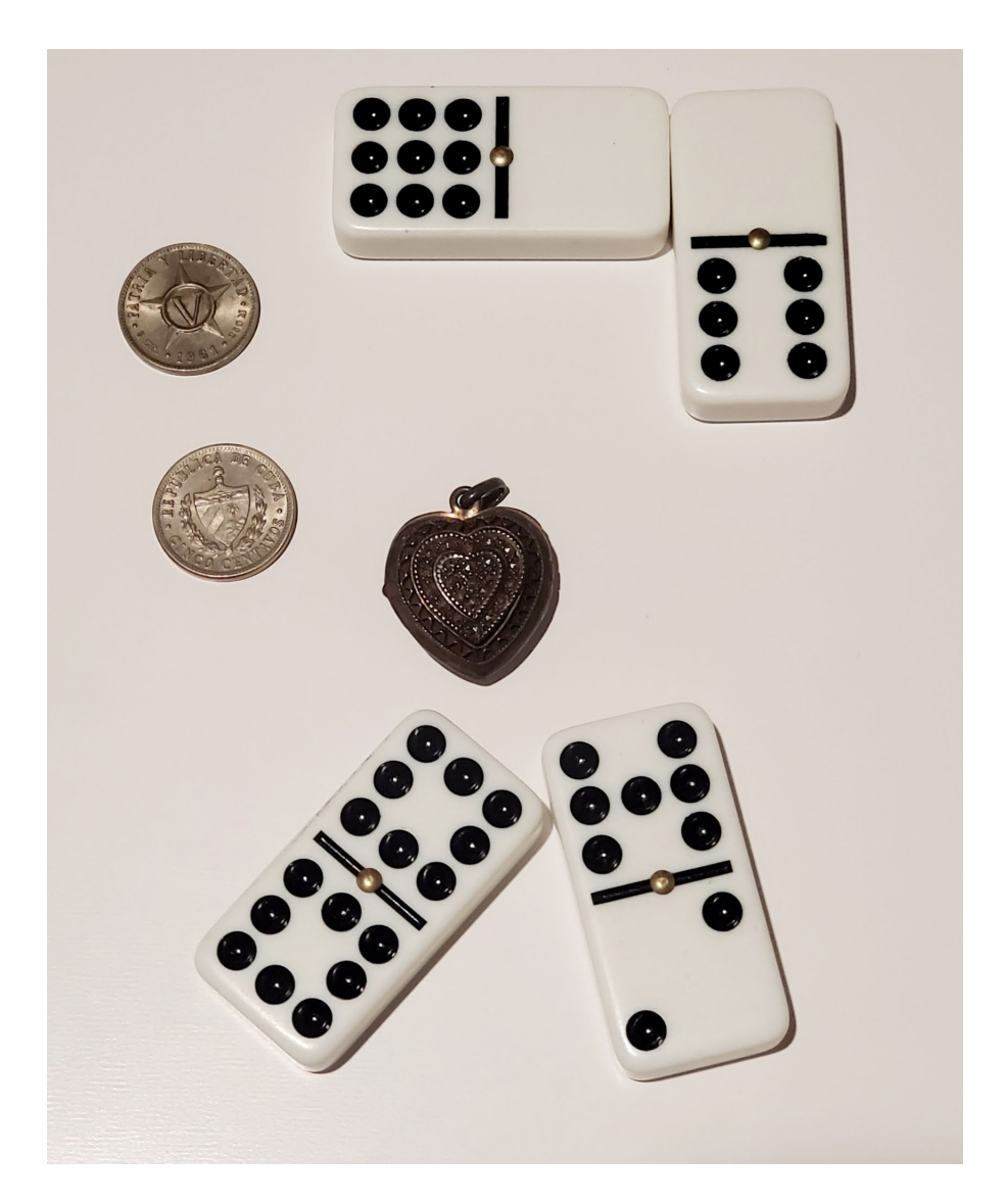
Figure 3. Researcher 3's Dominoes tiles, along with two silver coins that are currency from Cuba. The coins are dated 1961, a time when both my paternal and maternal families were still living on the island. The coins read, 'Patria y Libertad', Spanish for homeland and freedom. The heart locket in the middle belonged to the researcher's paternal grandmother and houses a photo of when the researcher was 5 years old.