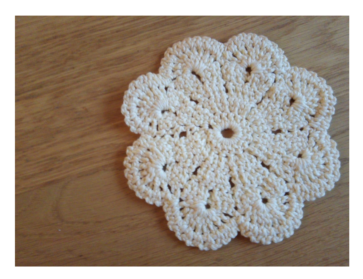
Figure 2. Researcher 2's memento from their grandmother's annual family gathering