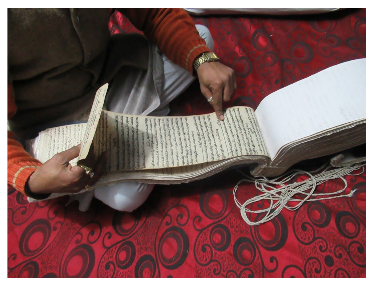
Figure 1. Image of a Panda in Haridwar, India, looking up the family genealogy register