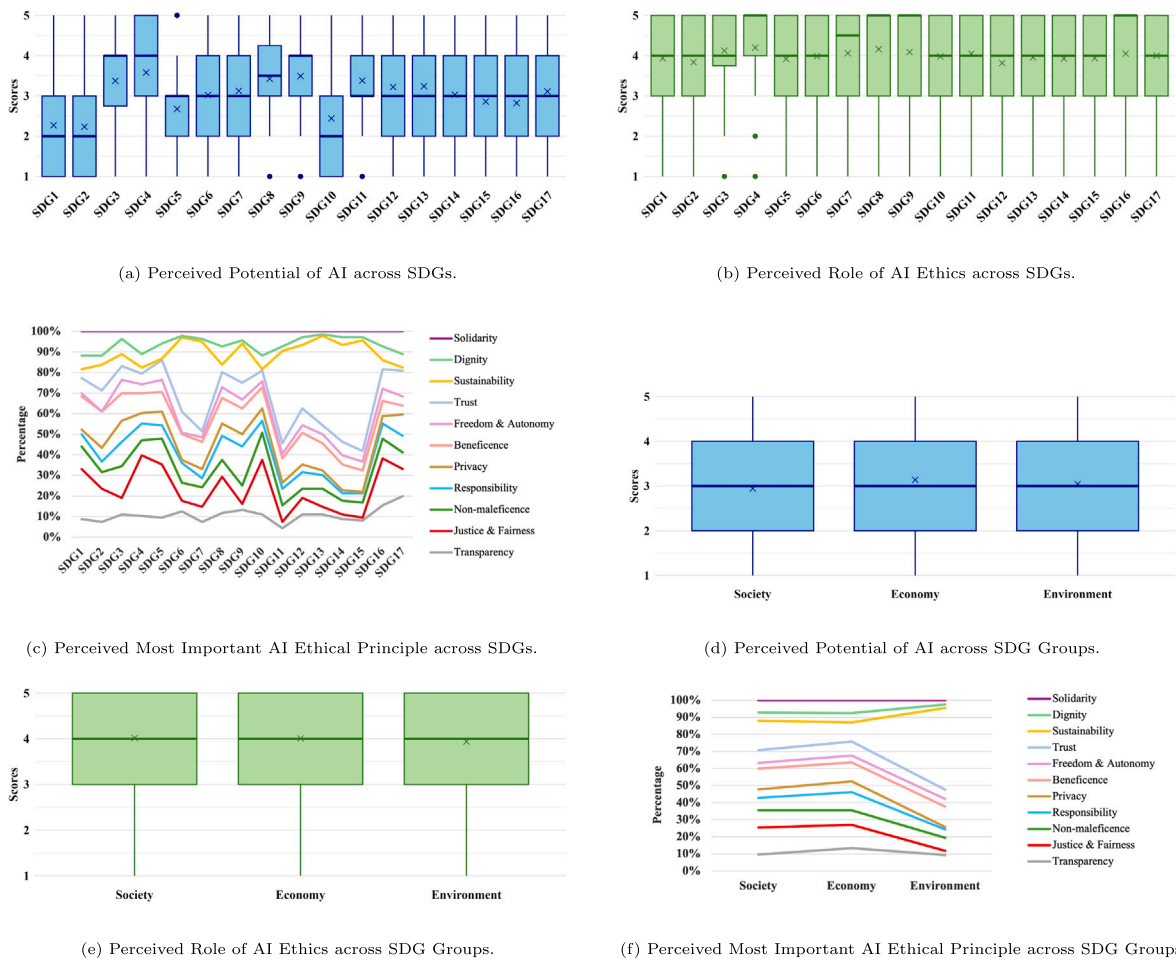
Fig. 1. Results for User Perceptions across SDGs and SDG Groups. In this figure, the (a), (b), and (c) refer to the perceived potential of AI, the perceived role of AI ethics, and the perceived most important AI ethical principle across SDGs, respectively. The (d), (e), and (f) refer to the perceived potential of AI, the perceived role of AI ethics, and the perceived most important AI ethical principle across SDG groups, respectively.

Conover tests (with a Bonferroni correction) to analyze differences in the perceived AI’s potential and the perceived role of AI ethics across different SDGs and SDG groups. Besides, we use a Rao-Scott chi-square test followed by post-hoc tests via pairwise Rao-Scott chi-square (with a Bonferroni correction) to analyze correlations between the perceived most important AI ethical principles and SDGs and SDG groups, respectively. Specifically, the Friedman test is an alternative to one-way ANOVA with repeated measures when the assumption of normally distributed data is violated Goel et al. (2022) , Friedman (1937) . Additionally, the Rao-Scott chi-square test is used when the dependent variable is categorical and independent observations are far from true Scott (2007) , Rao and Scott (1981) . Fig. 1 shows the output plot for the user perceptions across distinct SDGs and SDG groups.