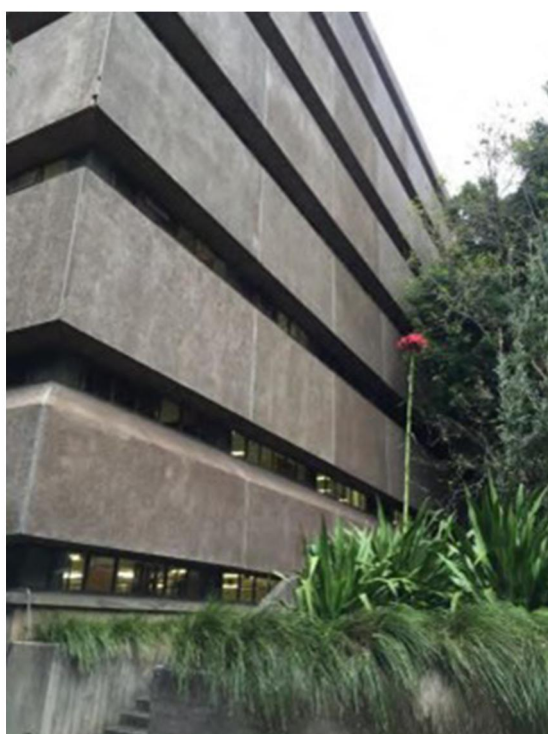
Fig. 3. Two views of the Molecular Bioscience building at the University of Sydney (Philip Kuchel).